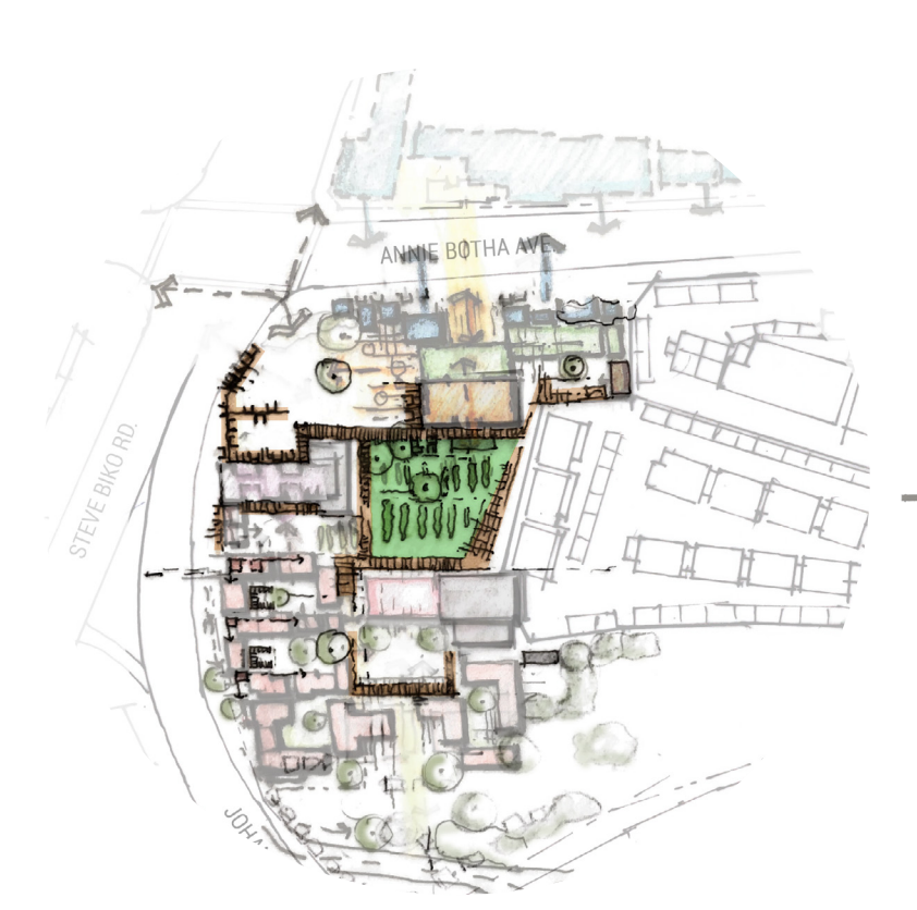
Phase 1: Temporal Insertions

In this essay, various analytical tasks were undertaken to better understand the site, its users and their needs in terms of both the historical and social condition. This, along with the precedent studies, guided an approach of incrementality, adaptability, flexibility and multiplicity to programme and design. The existing activities of appropriation on site, multiple tangible and intangible tensions, and the in-depth study of the site and user groups has led to a multi-layered mixed programme with three strands: a social welfare component, a public [commercial] interface component and an anchoring link between the two. This programme is envisioned to develop on site within a conceptual phased framework that remains sensitive to the social condition and heritage buildings, and also remains resilient in that it in itself should be re-evaluated and adjusted according to changing needs and discoveries moving forward. The conceptual strategy/framework lays the foundation for a sensitive approach to the site and users, where the transitional housing programme in the "social welfare pocket" forms the focus for further research and design resolution in Essay Three.