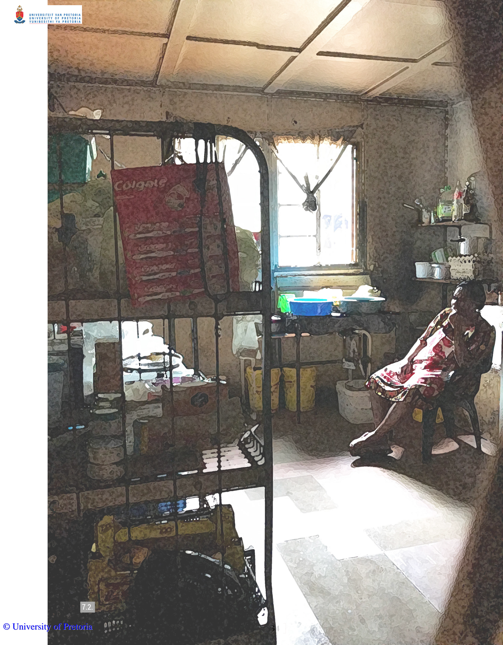
Fig. 7.1. Previous page: Photograph of 1:1000 initial site maquette (Author 2021). Fig. 7.2. Right: Photograph of an old hostel room appropriated into a tuckshop (Author 2021).

The analytical tasks in this essay, and interpretation thereof into design strategies and principles, are aimed at developing a sensitive and well-considered programmatic approach that translates into a conceptual strategy and vision for the site as a whole, which will be discussed in the final section of this essay. This site vision will serve as a conceptual framework for a more focused design intervention to follow, where the detailed design development will centre on a particular aspect and area of the overall vision.