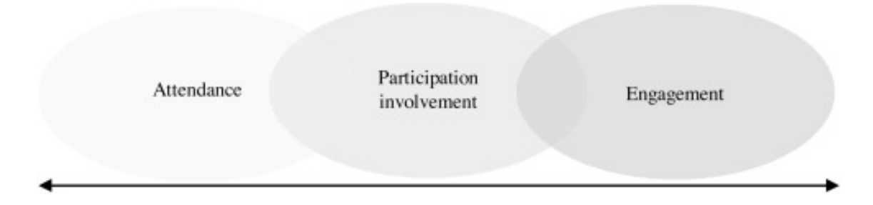
Fig. 1. A continuum of engagement related constructs.

The parent-professional relationship is highlighted as central to initiating and maintaining a parent's engagement in their child's intervention (D'Arrigo et al., 2019; King et al., 2019a; Melvin et al., 2019). The notion of a role is contextualized within the evolving relationship between the client (i.e., the parent) and the professional that is inherent to intervention (King et al., 2014). The quality of parent-professional