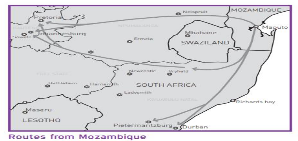
Figure 1: Routes from Mozambique

'Ponta Do Ouro', border post located in Mozambique. The transport continues into the South of Swaziland or directly into Pretoria and Johannesburg or Durban and Pietermaritzburg (UNESCO 2006:28). Traffickers can easily access these routes because it is believed that these routes are their links with criminals that deal with other activities such as hijackings and armed robberies. Complicity is formed with border officials at the main crossings between Mozambique and South Africa, thus allowing for free movement at the relevant border posts without requesting the necessary documentation and patrol (UNESCO 2006:29).