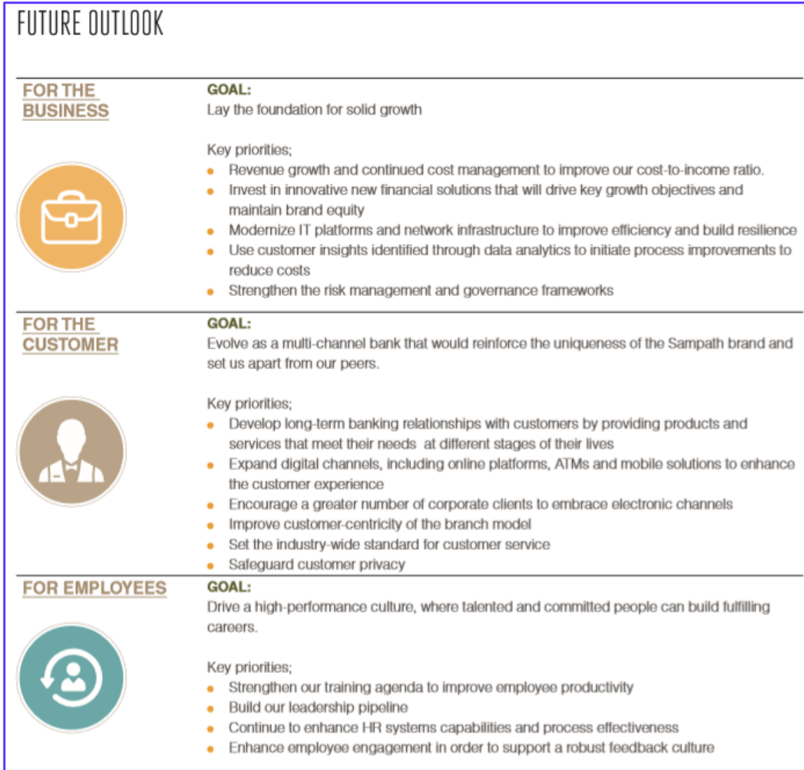
Figure 3: Future Outlook