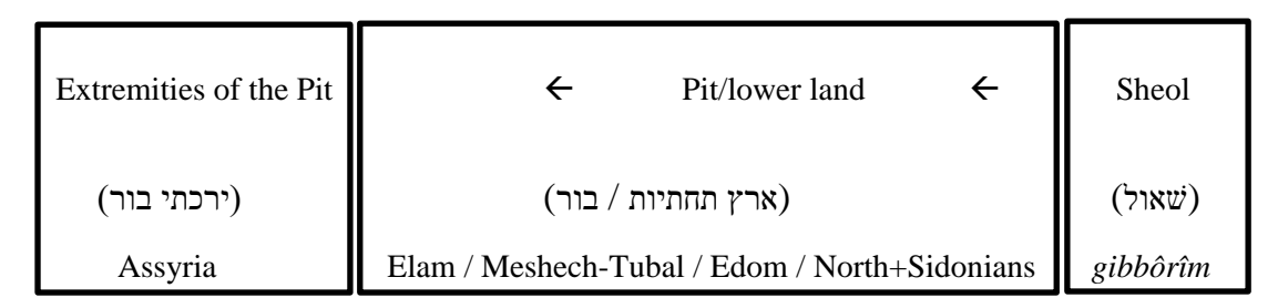
Fig. 2. Ezekiel's Underworld

In Ezek 32, Egypt, as the newcomer and the recipient of this "tour of hell," is not necessarily ranked like the others. It is not part of the tour of nations introduced by the demonstrative particles. On the other hand, it is the main focus of the passage and (as Chart 1 reflects) the recipient of the most verbiage; this emphasis would be more pronounced if vv. 31–32 were also added into the count. Furthermore, Egypt is welcomed to the underworld with an insult, just like the king in Isa 14.