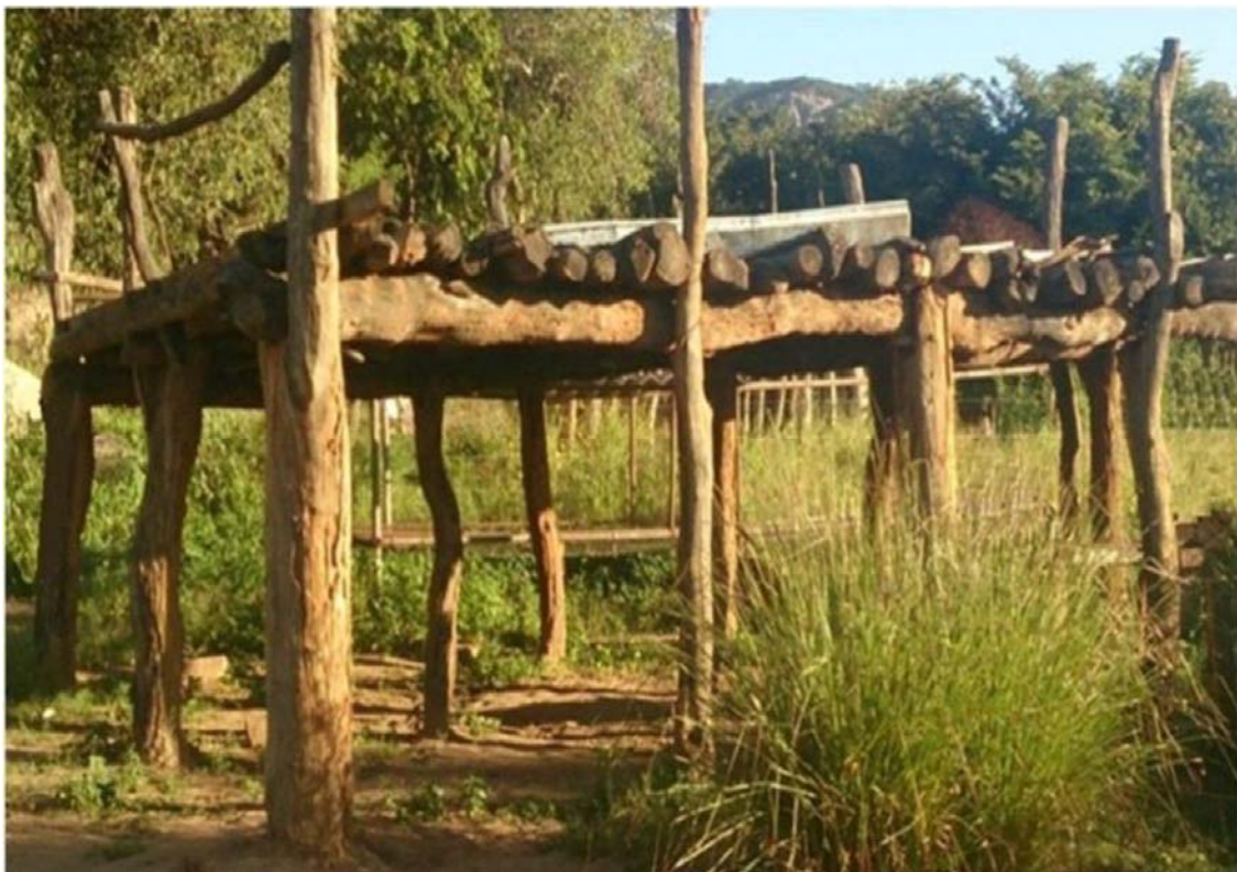
Figure 1. Loading platform

Mr Gara, the local farmer, has recently built a wooden structure ('Dara' in Shona) to store some of his farm harvest (Figure 1). The structure is made from specially dried and stripped logs of the 'muwanga' tree. Some of the long vertical logs which are placed far apart and fixed in deep holes in the ground are used to support the platform. These vertical logs are held together by four horizontal logs forming a hollow rectangular shape above the ground. The loading platform consists of round logs, which are packed tightly to each other in a horizontal and parallel position. The rectangular base supports them. Mr Gara has other loading structures for storing the bags of harvested crops depending on their size and weight.