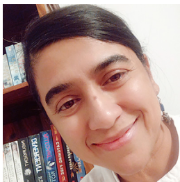
Jayashree Ratnam National Centre for Biological Sciences