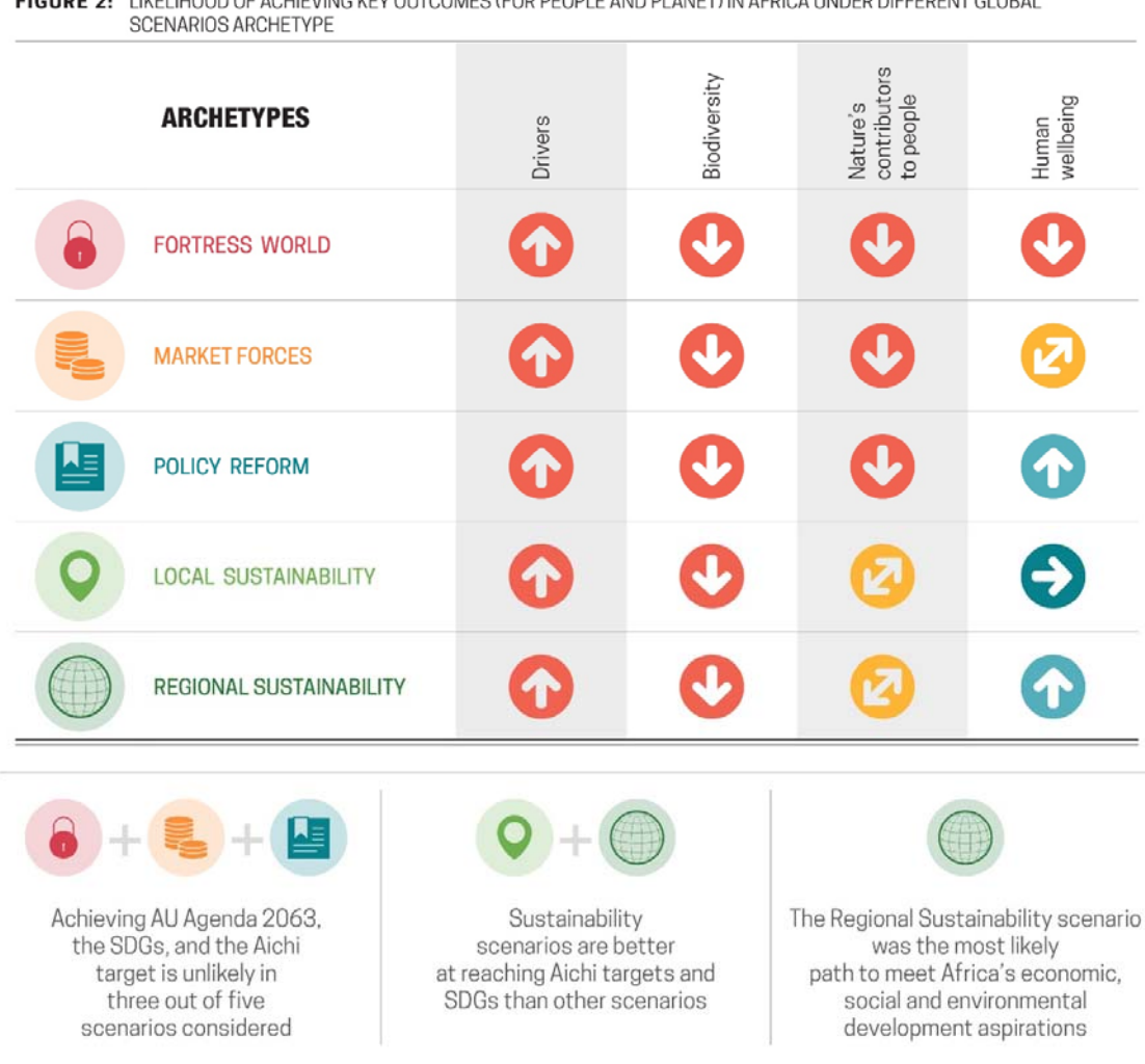
Figure 2: Likelihood of achieving key outcomes in Africa under different global scenarios archetypes