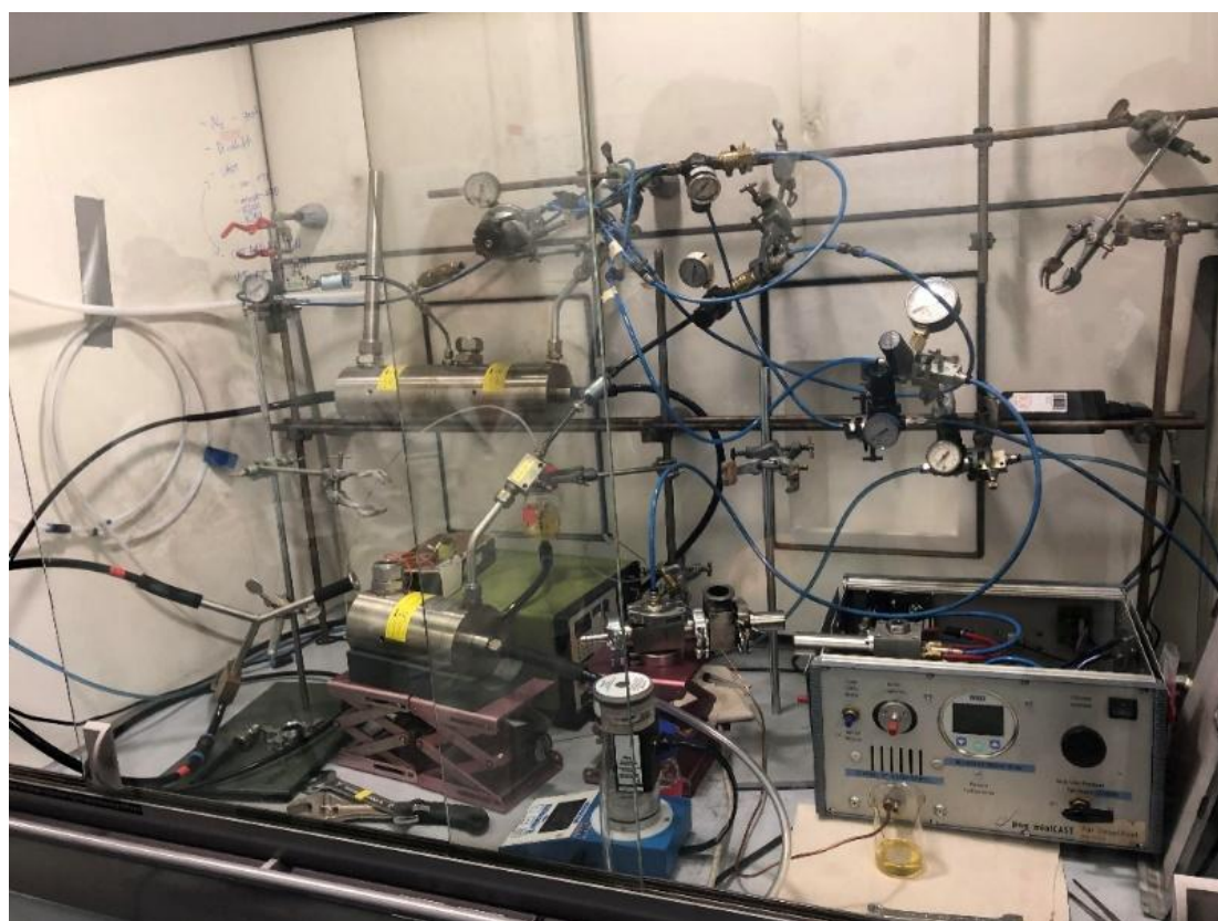
Figure S2: Photograph of the CAST generator sampling set-up.