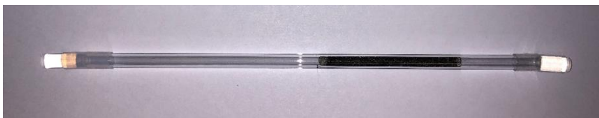
Figure S1: Graphene wool sampler showing the GW of 60 mm bed length housed in a glass tube with glass end caps held in place by Teflon sleeves.