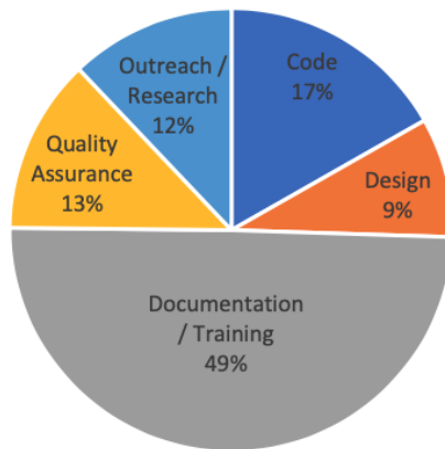
Figure 1: Overview of the distribution of tasks across each category.

To gently introduce the students to OSGeo, we created 10 beginner tasks that allowed them to learn essential technologies, such as GitHub, or understand plagiarism. The GCI rules allow each student to complete 2 beginner tasks. Only when they complete the third non-beginner task, they are eligible to win a t-shirt.