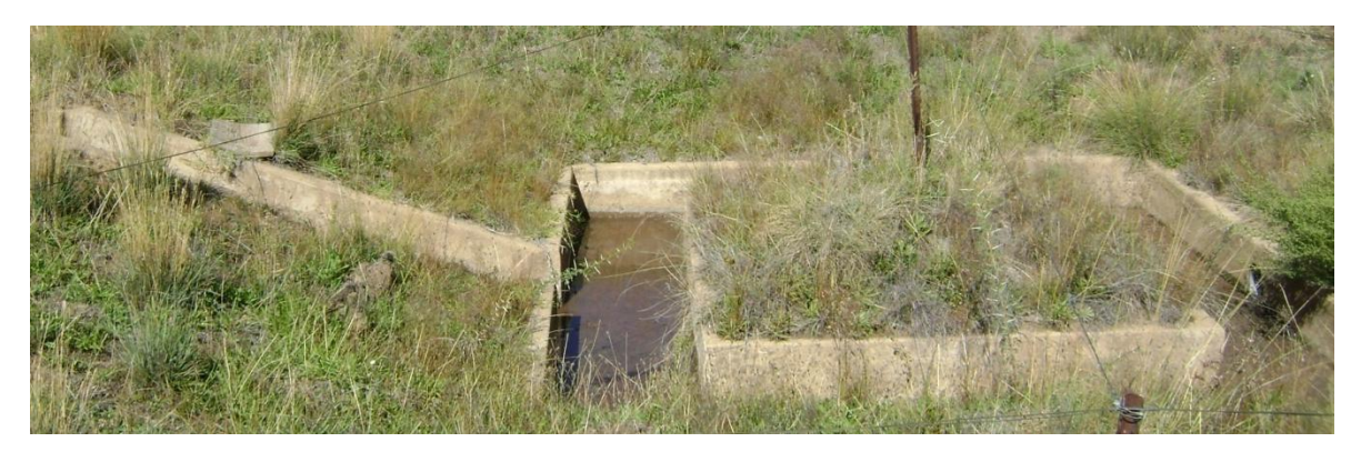
Figure 8 Channelling of water from Gariep Dam between the ponds on-site on the left and small outside pond on the right (Fraser, 2013)

Water supply for outdoor fish ponds is channelled to the facility via a pipeline directly from the Gariep dam wall (Fraser, 2013). Water is bought from the Department of Water Affairs and Forestry. The water capacity for the outdoor fish ponds has not increased from the original water capacity for the Gariep Dam Hatchery.