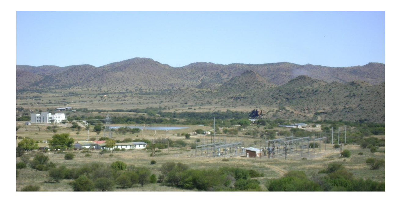
Figure 4. Overview of the setting and facilities at the demonstration centre (Fraser, 2013)

provides an overview of the environment surrounding the demonstration centre and a schematic of the facilities on site.