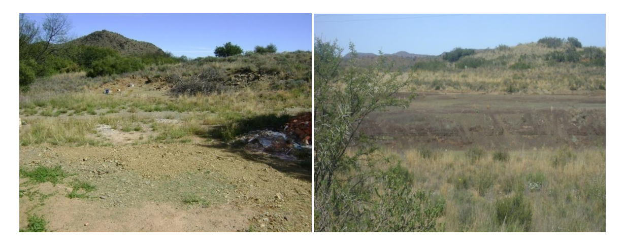
Figure 11 a. Building rubble lying on site, b. lack of rehabilitation with high soil erosion potential

According to the environmental authorisation, section 1.25, the holder is responsible to "Rehabilitate denuded areas, especially slopes, with appropriate species and erosion protection measures..." during the construction phase of the activity (The Department of Tourism, Environmental and Economic Affairs, 2009, p.12). Section 1.27 states that "All the areas disturbed during the construction work needs to be landscaped to a similar or better than previously, on completion of the works". However, as illustrated in Figure 11, this has not occurred on all areas of the site, despite the fact that construction was completed and the site was signed off in February, 2013, as per Box 3.