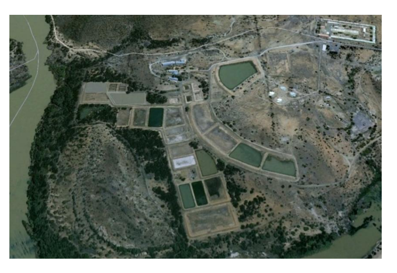
Figure 3 Facilities at the existing Gariep Dam Fish Hatchery (Google, 2013)