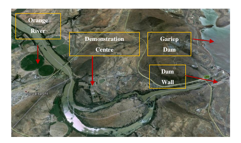
Figure 2 Location of the South Africa China Agricultural Demonstration Centre (Google, 2013)

The South African China Agricultural Demonstration Centre is located at the existing Gariep Dam Fish Hatchery. This centre is located below the Gariep Dam Wall on the Orange River, see Figure 2, on Portion 1 and 3 of the farm Waschbank 274. Figure 3 provides an aerial view of the facilities which are currently at the hatchery. The co-ordinates for the centre are: 30°37′35,82"S 25°28′ 24,61"E. The site stretches approximately 580 meters East to West and 740 meters North to South (Song, 2013 a)