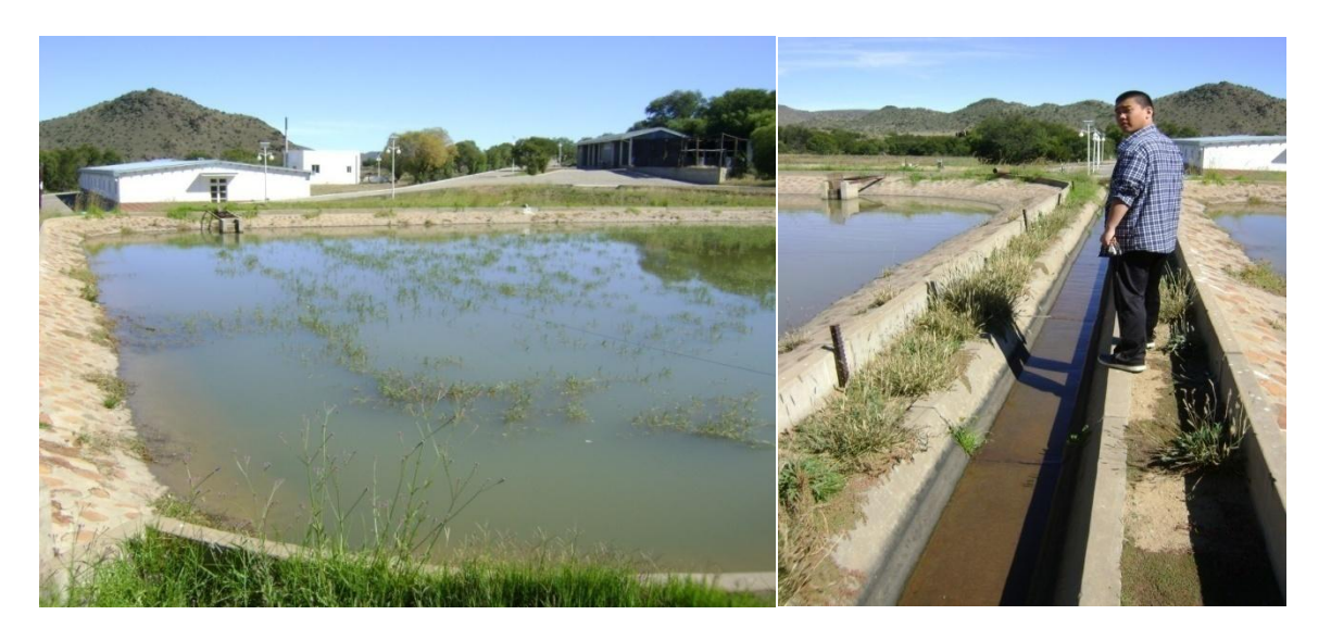
Figure 9 Pond for large fingerlings on the left with feeding lines and channelling of water on-site with Chinese interpreter, Mr Song, on the right (Fraser, 2013)

The facility has 36 outside dams, approximately 6.67 hectares, which are all linked to water, electricity, roads, oxygen machines and feed casting machines, see Figure 8 and Figure 9 (Song, 2013 a). The dams are grouped into 6, where each group forms an independent system with waste water recycling and processing (Song, 2013 a).