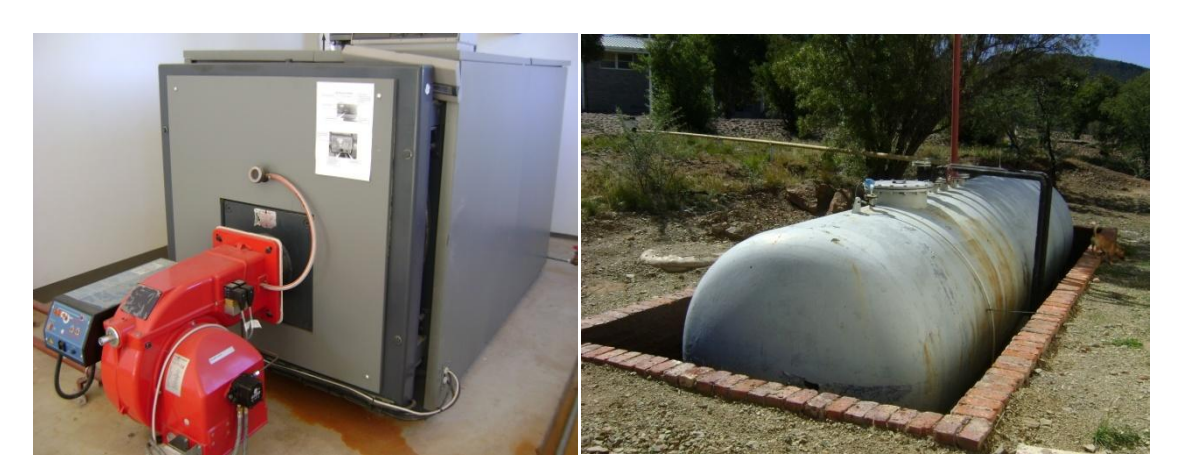
Figure~7~a.~hot~water~boiler~body, b.~30~000l~diesel~tank, feeding~into~the~boiler~(Fraser, 2013)

In order to ensure that the water temperature inside the tanks is kept constant throughout the year a hot water boiler, with a capacity of 2 ton, has been installed in a boiler room, see Figure 7. The boiler room houses the boiler body, circulating pump, controlling tank, controlling pressure water supply equipment, oil storage tank, daily oil tank, oil pump and hose and water softening tank. The boiler room has a footprint of 78,12m^2 . Diesel is supplied to the boiler via a 30 000L above ground diesel tank installed within an impenetrable bund wall area constructed according to SANS 10089:1 standards, see Figure 7 (Enviroworks, 2009; Fraser, 2013).