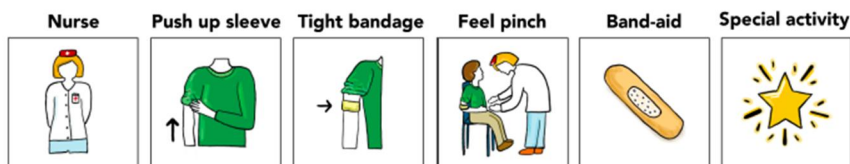
Figure 2: Visual schedule of a needle procedure.

The discussion earlier in this chapter makes it clear that children's previous negative pain-related encounters influence how they perceive new pain experiences. Furthermore, since children with ASD and intellectual disabilities need routine to function optimally, visual schedules can be used to great benefit to prepare them for specific medical procedures. This preparation could reduce their anxiousness due to unfamiliarity with the procedure or previous negative experiences [15, 76]. A visual schedule should include a step-by-step and easily understandable format with pictures accompanied by written words (See Figure 2 for example). These will provide children with the necessary information to help them feel that they are in control of the imminent frightening procedures [77]. Visual schedules can be offered either in paper format (low-technology) or, where applicable, in a video story-based format.