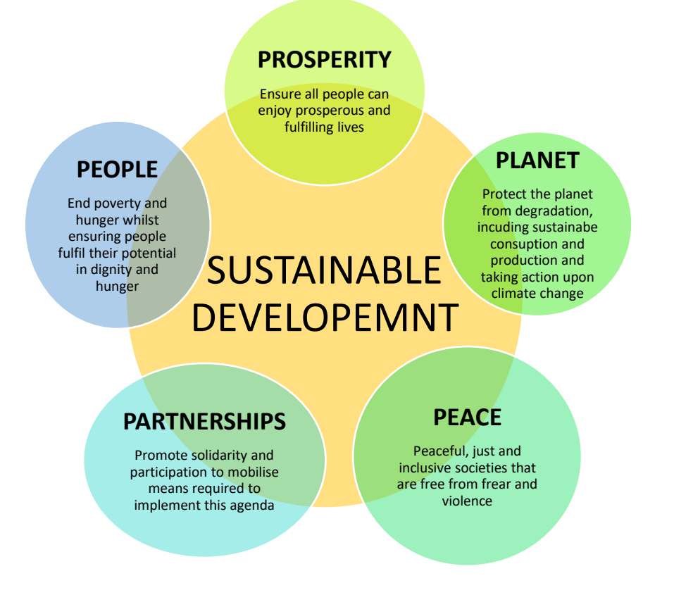
Diagram 2.1: Five Ps of Sustainable Development