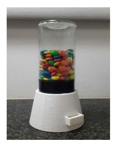
Figure 2: Candy dispenser