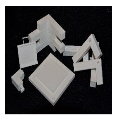
Figure 1: Pencil holder

means to do so, including the internet and asking friends or family. In this way, students are prepared for the world of work, where one is not given a recipe for completing a task. Further, the open-ended nature of this project serves as an enrichment opportunity for exceptional students.