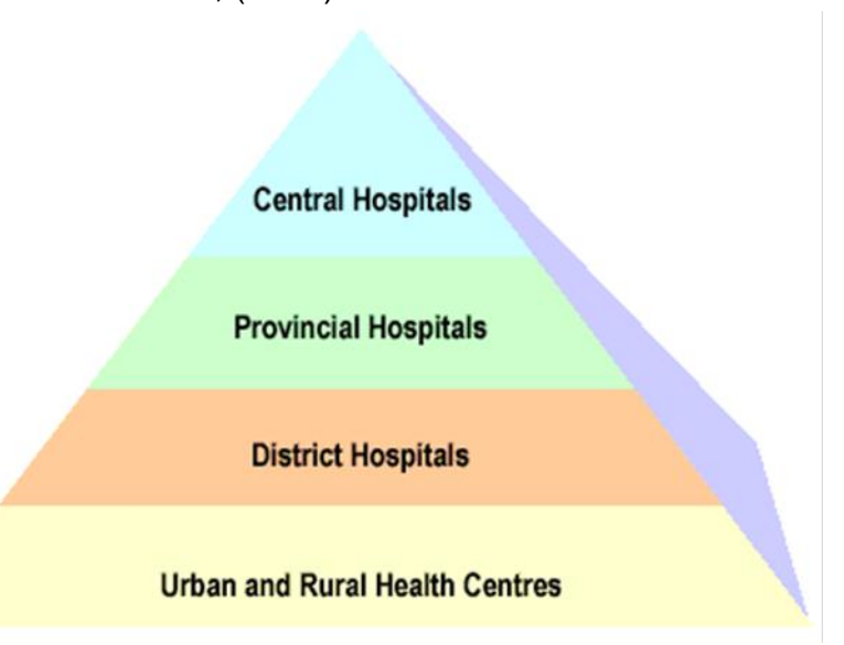
Figure 4.2 -Source: Shamu et al., (2010)