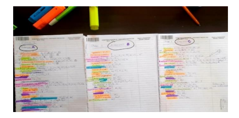
Step 4: The themes were clustered together, identifying both main and sub-themes. A summary table of the subordinate themes was written on the front pages of each transcript, with the corresponding quotations highlighted and the relevant page number identified.