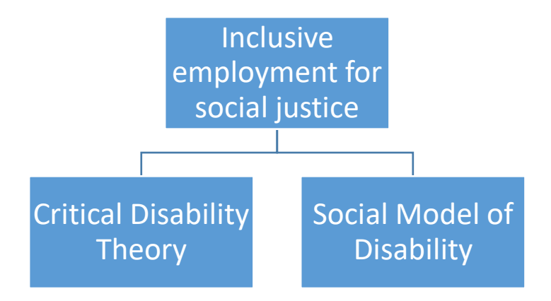
Fig. 2.2. Conceptual framework

A conceptual framework is a key part of the research design of a study, as it is a system of concepts, expectations, assumptions, theories, and beliefs that strengthens and informs a study (Robson, 2011). The conceptual framework of this study, inclusive employment for social justice, is informed by Critical Disability Theory and the Social Model of Disability. Critical Disability Theory and the Social Model of Disability will be discussed, after which the conceptual framework, inclusive employment for social justice, will be explained.