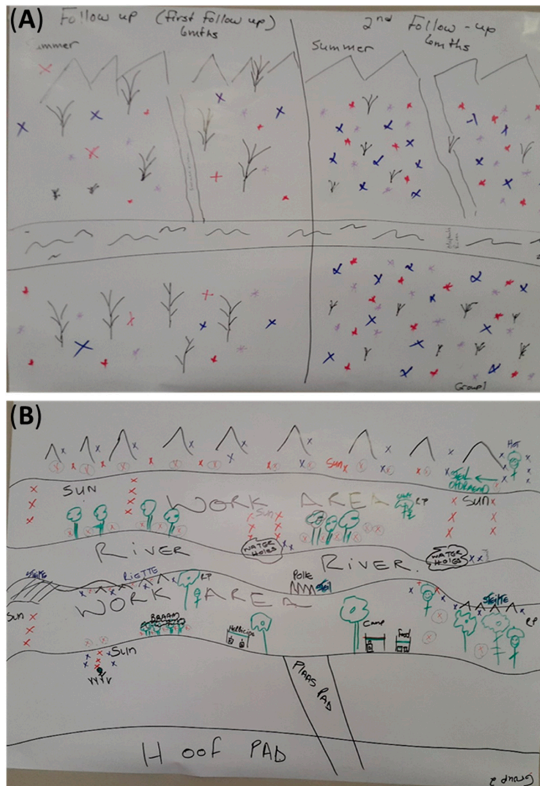
Figure 3. Examples of heat and sun exposure artwork drawn by study participants (these images were retained as drawn and have not been redrawn in any software package to preserve the details hand drawn by the participants.) (A) Highlights the difference between heat exposure (blue) and sun exposure (red) from successive follow-up visits. This shows increased exposure when vegetation is shorter in later follow-ups (on right hand side, labeled as “2nd follow-up, 6 months (after previous visit)”). (B) Highlights the varied work environment including mountains, rivers, trees, reeds (labeled in Afrikaans as “riette”) and open fields. Afrikaans translation of words in 3B are hoof pad = main road, plaas pad = farm road, steilte = uphill, polle = grass, steil opdraend = steep uphill.

Mapping starts with the premise that the participants have detailed knowledge and expertise that may not be forthcoming through standard focus group discussions. It allows participants and researchers to see the interconnectedness of potential health problems and exposures within workplaces. Through the use of drawing, color-coding, and simple symbols, mapping can overcome the barrier of language differences and potential limited literacy. In addition, its use encourages discussion and analysis, and as such is also helpful as an icebreaker [51].