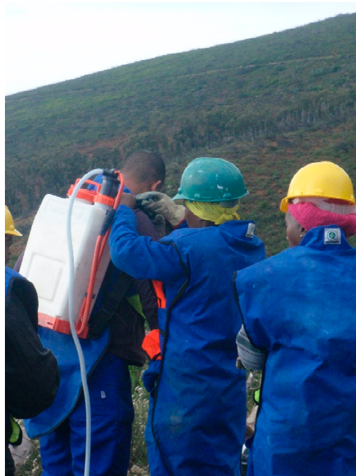
Figure 1. Example of Working for Water workers putting on backpack and Personal Protective Equipment (PPE) for herbicide spraying (Photo by Hanna-Andrea Rother).

The main purpose of the PPE for herbicide application is to reduce exposure to chemical hazards (i.e., chemical impermeable aprons, long-sleeved shirts, and trousers), rather than from the outdoor elements per se. Wearing such PPE in high temperatures can increase the risk of workers to heat-related illnesses [14,40]. The PPE may protect the workers from some exposure to solar UVR but risks still exist. Depending on bodily position and activity, horizontal surfaces can receive twice as much exposure as vertical surfaces when an upright body is perpendicular to the Sun [41]. The facial region has been found to receive between 19% and 56% of the ambient solar UVR, while vertical surfaces such as the