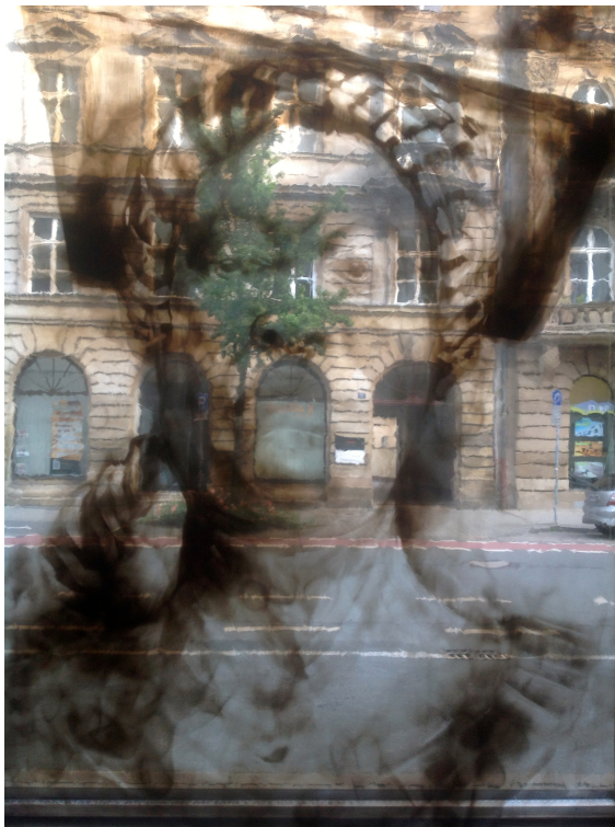
looking through her .