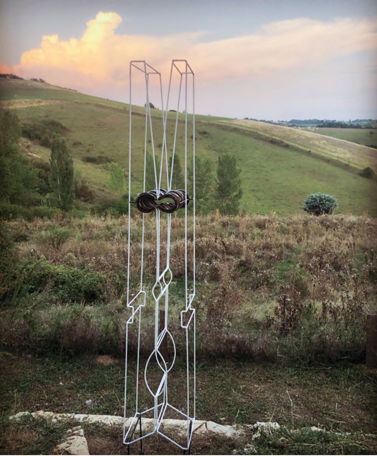
Usha Seejarim C'est comme ça 2019 Steel and Horse Shoes 300 x 80 x 90 cm