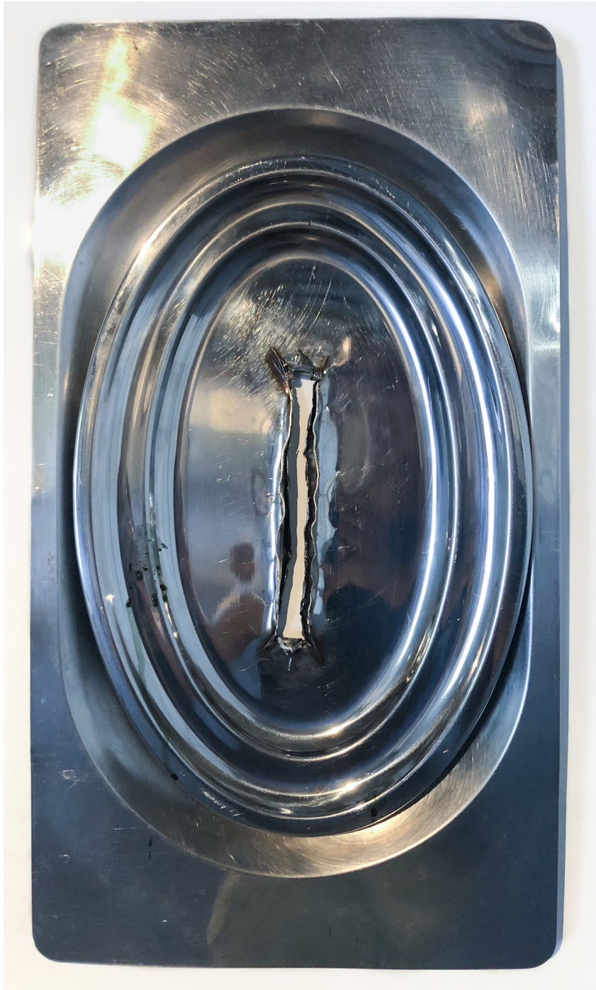
Usha Seejarim Prepared to serve 2019 Assemblage of Found Objects 32.5 x 50.5 x 3 cm