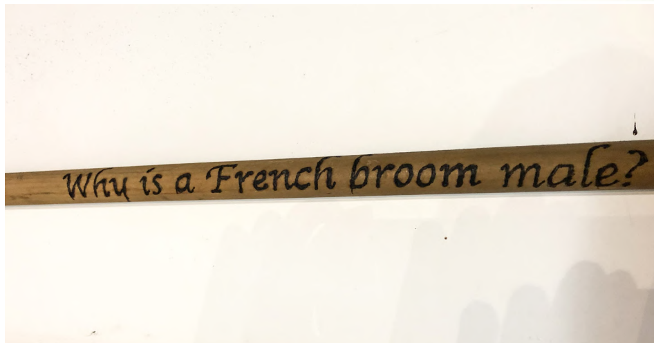
Usha Seejarim Why is a French broom male? 2019 Assemblage of Found Objects 126 x 3 x 3 cm