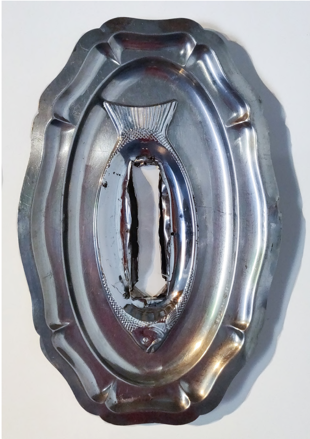
Usha Seejarim Ready to serve 2019 Assemblage of Found Objects 25.5 x 46 x 2 cm