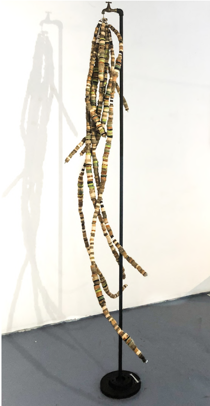
Usha Seejarim Water is itself not wet 2019 Assemblage of Found Objects 246 x 96 x 60 cm