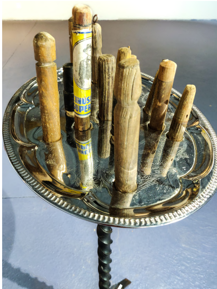
Usha Seejarim 3rd Serving of Broom Heads 2019 Assemblage of Found Objects 48 x 34 x 5 cm