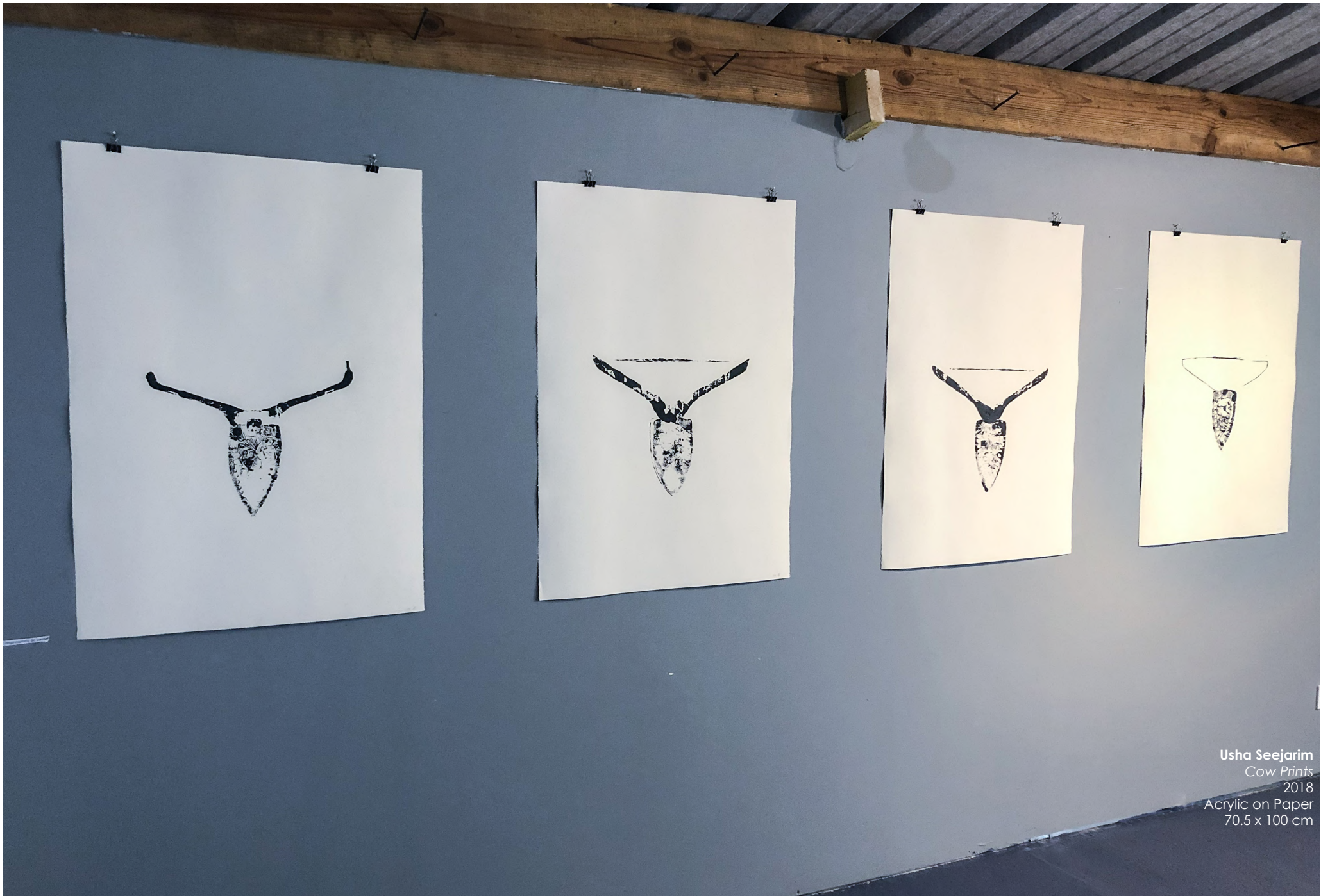
Usha Seejarim Cow Prints 2018 Acrylic on Paper 70.5 x 100 cm