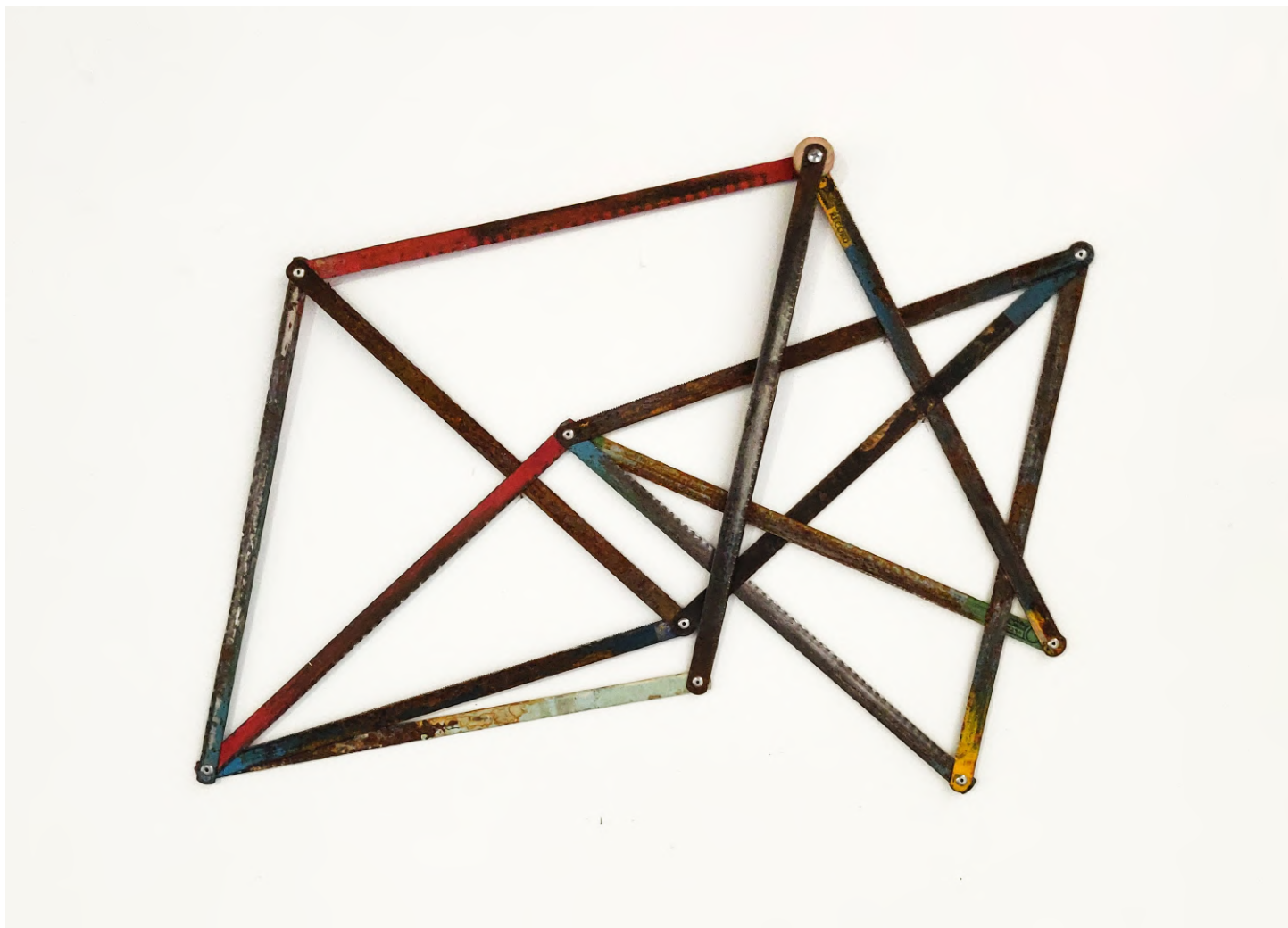
Usha Seejarim A cutting edge composition 2019 Assemblage of Found Objects 53 x 36.5 x 3 cm