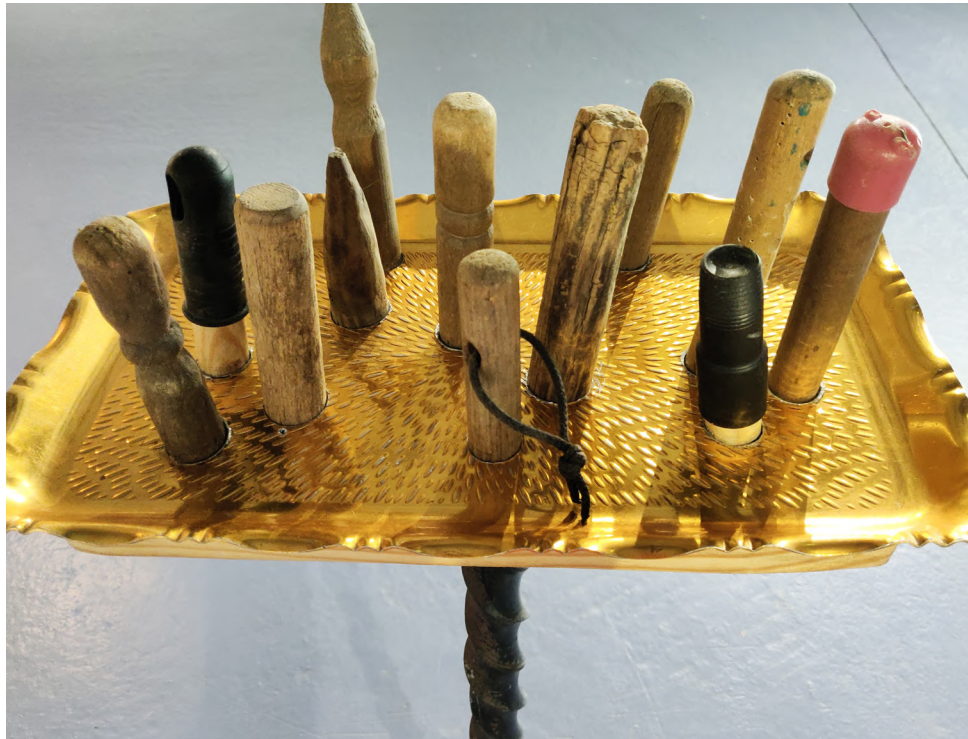
Usha Seejarim 2nd Serving of Broom Heads 2019 Assemblage of Found Objects 24 x 41 x 5 cm