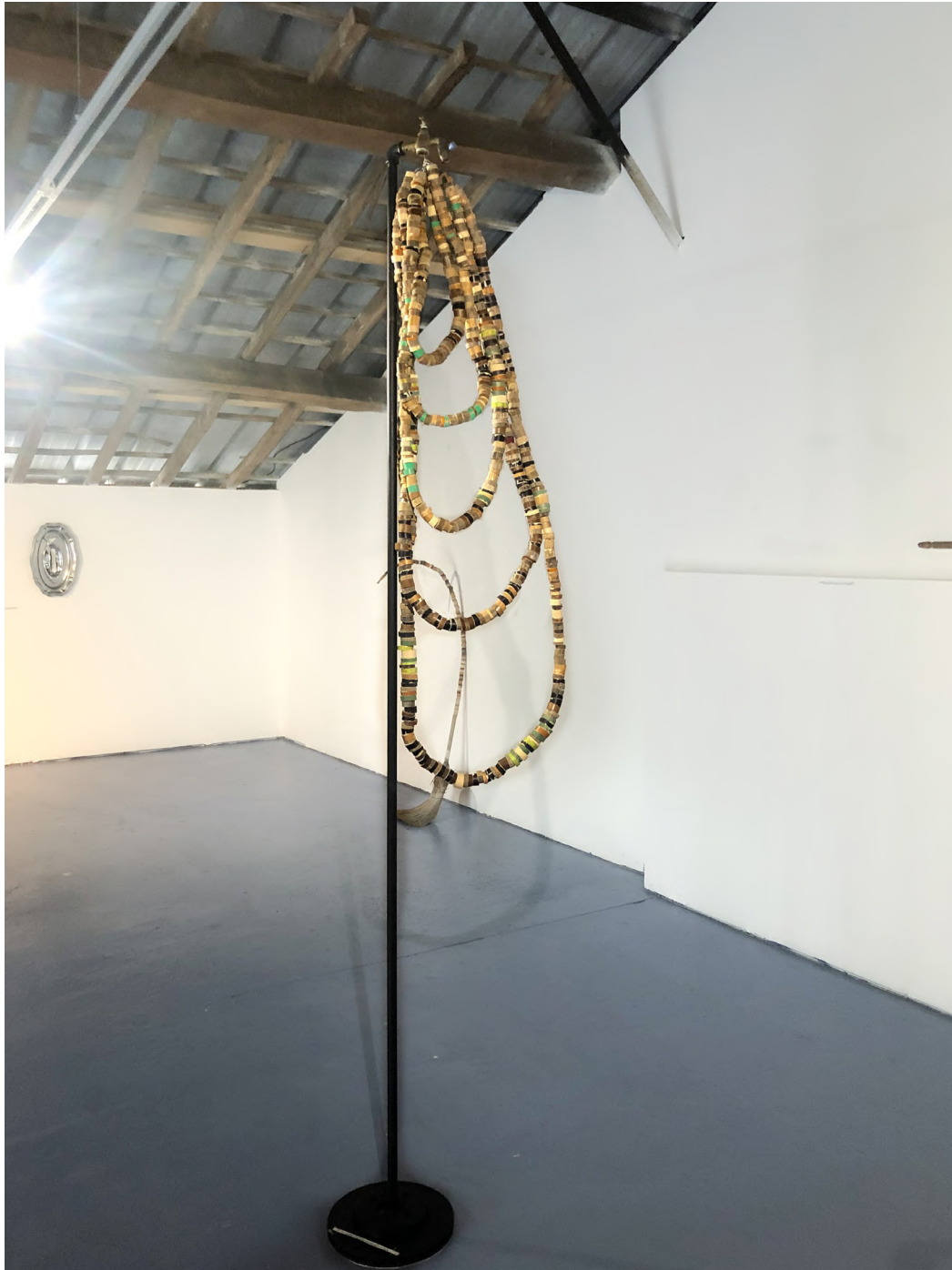
Usha Seejarim Wetness is not essential to water 2019 Assemblage of Found Objects 245 x 41 x 18 cm