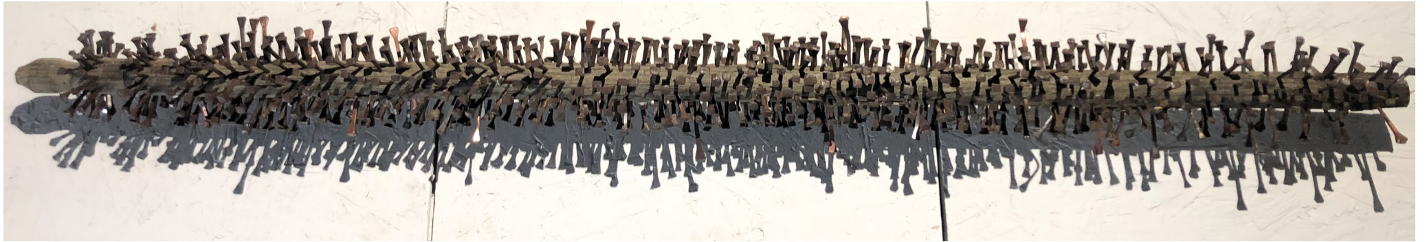
Usha Seejarim Overdomesticated 2019 Assemblage of Found Objects 106.5 x 11 x 12 cm