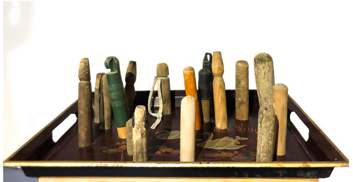
Usha Seejarim 1st Serving of Broom Heads 2019 Assemblage of Found Objects 48 x 31.5 x 6 cm