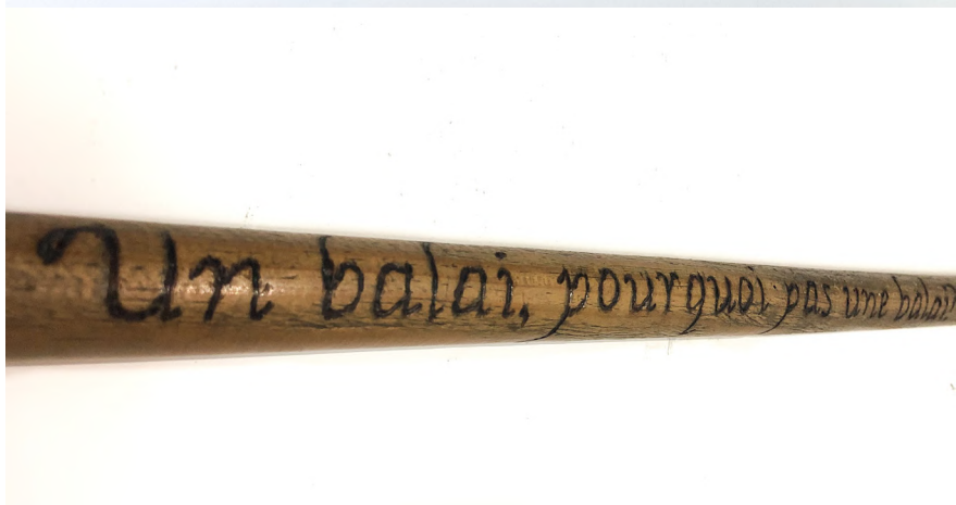
Usha Seejarim Une balai pourquoi pas une balai? 2019 Assemblage of Found Objects 120 x 2.5 x 2.5 cm