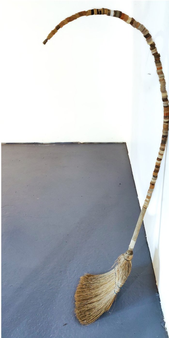
Usha Seejarim True to its nature 2019 Assemblage of Found Objects 142.5 x 53 x 40 cm