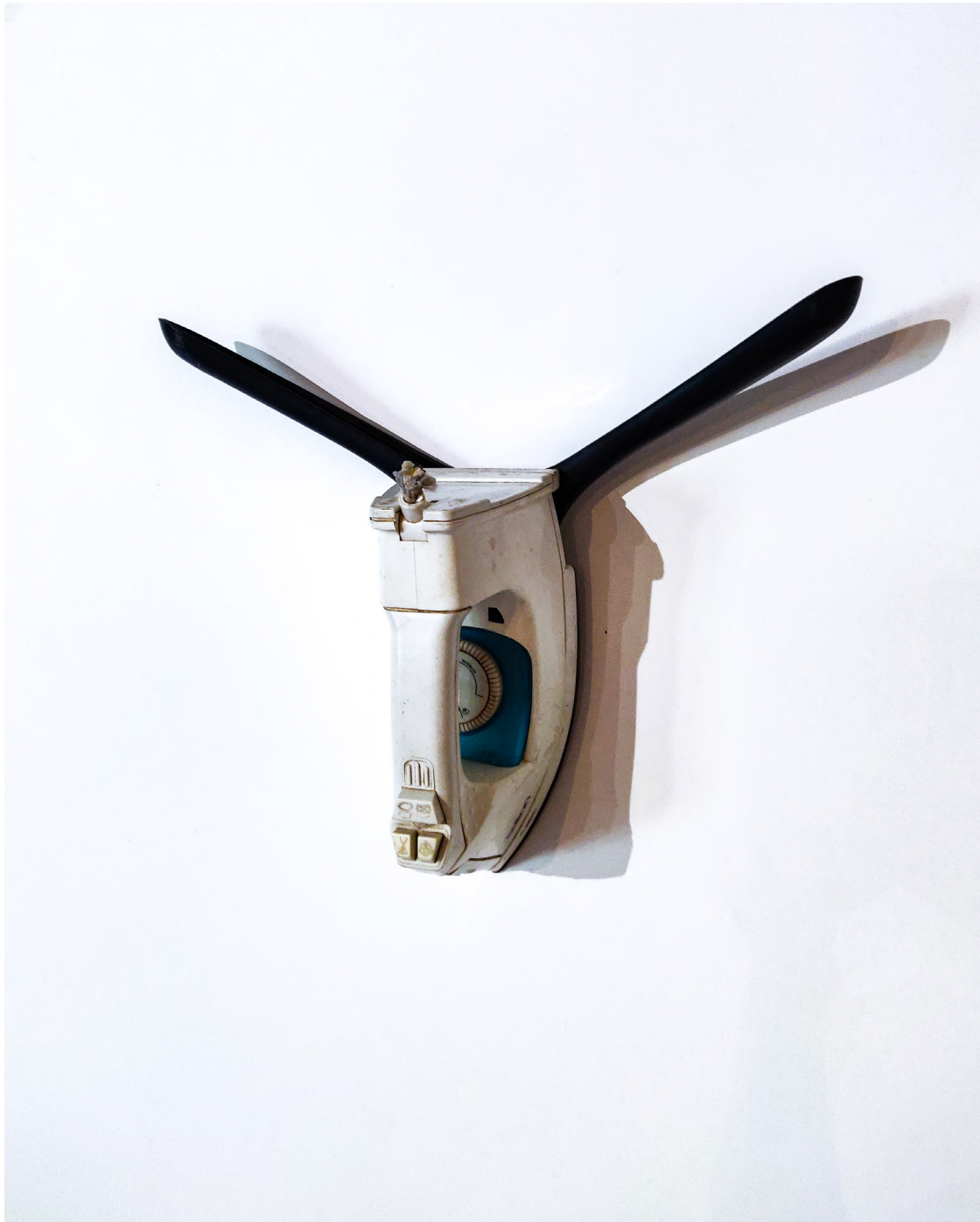
Usha Seejarim Cow's Head 2009 Assemblage of Found Objects 39 x 42 x 18 cm