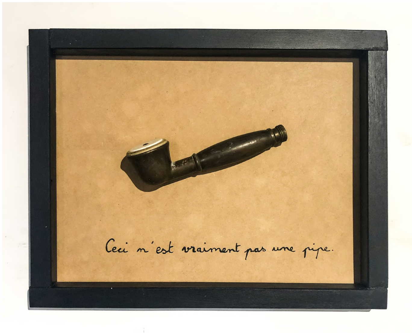
Usha Seejarim This is really not a pipe 2019 Assemblage of Found Objects 40.5 x 31.5 x 26 cm