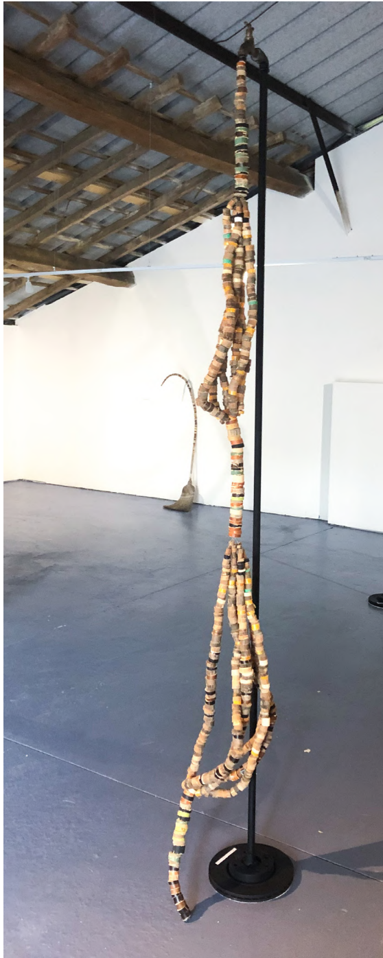
Usha Seejarim Water is not wetness 2019 Assemblage of Found Objects 244 x 27 x 28 cm