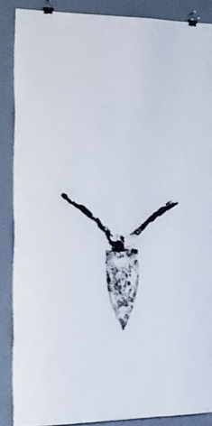
Usha Seejarim Cow Prints 2018 Acrylic on Paper 70.5 x 100 cm