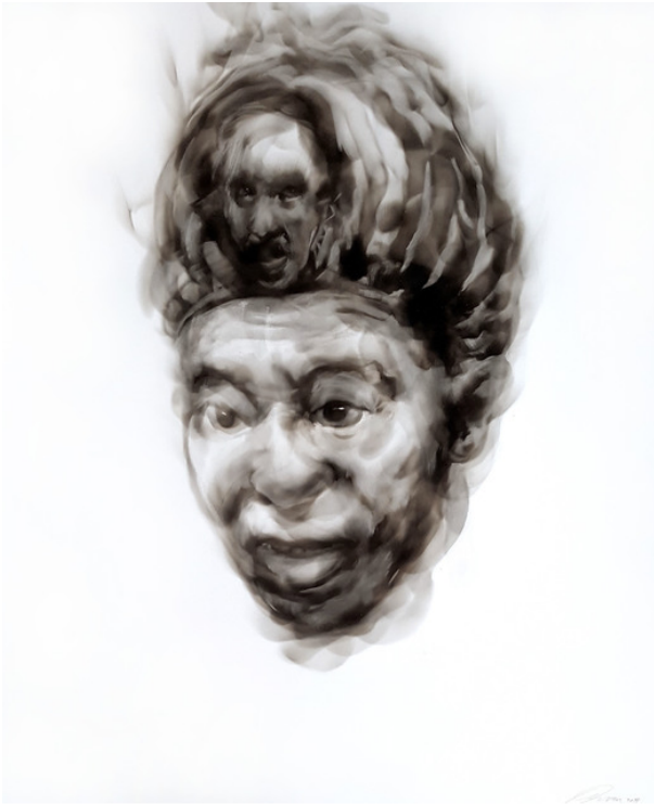
Thinking of you [ Yoruba - gelede mask ] Smoke on paper 61 cm x 45 cm