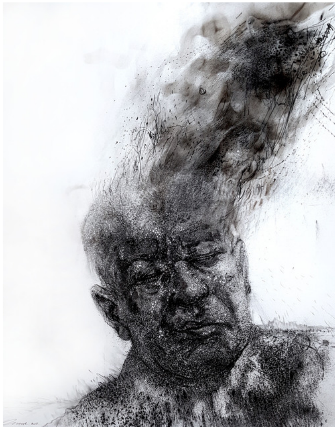
The man who lost his head Charcoal and smoke 61 cm x 48 cm