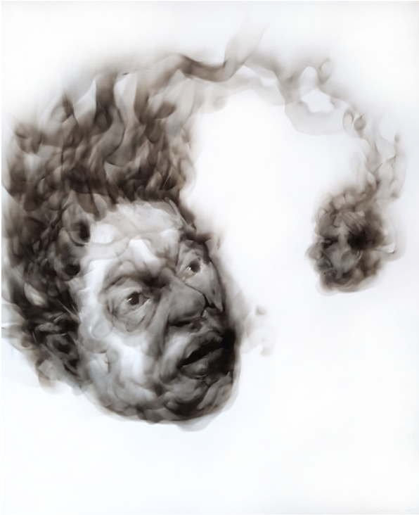
Second Thoughts [ mukenga kuba] Smoke on paper 61 cm x 45 cm