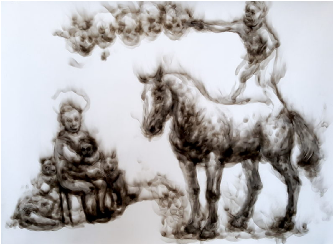
Spinning truths, circus lives . Smoke on paper 115 cm x 148 cm