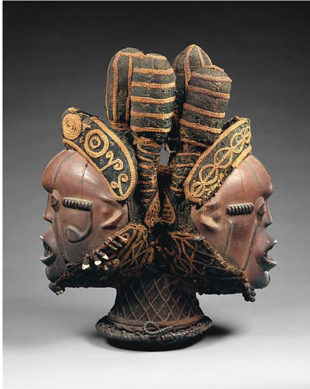
Ideas that got away - Janus [ nkuambok] Boki Smoke on paper 122 cm x 49 cm