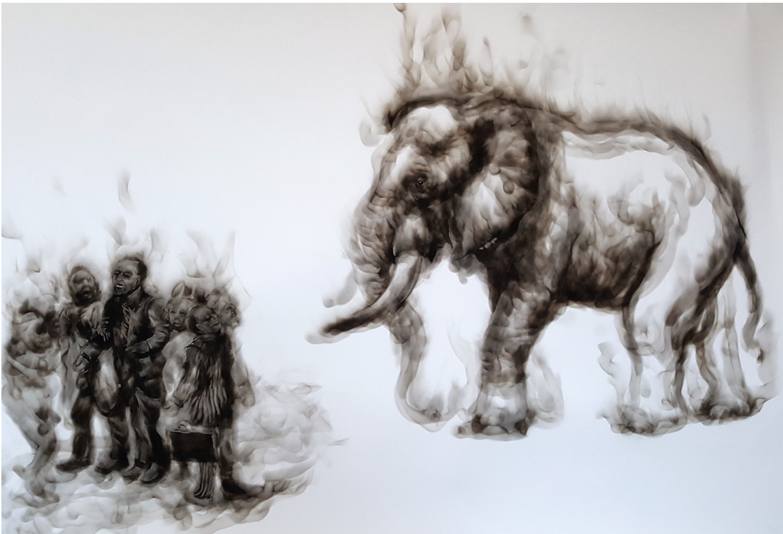
A matter ignored Smoke on paper 115 cm x 148 cm Installation shots – DKP