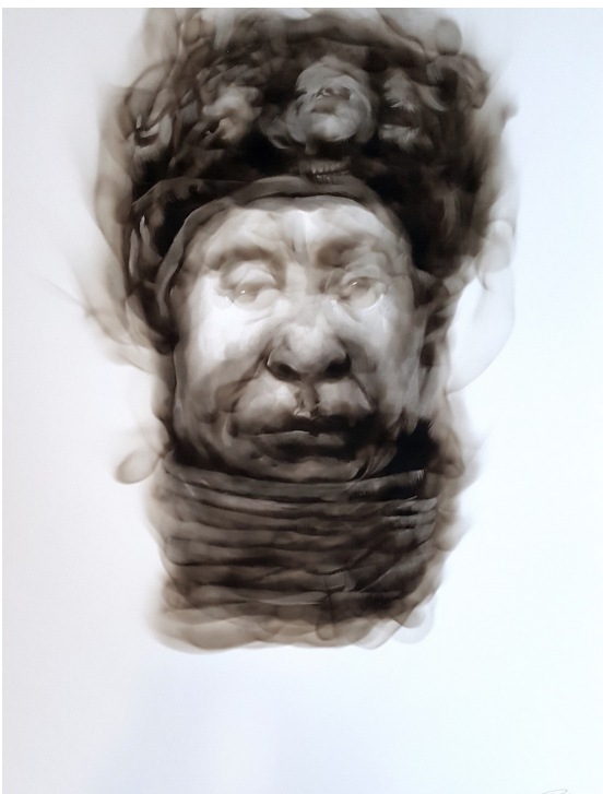
keeping a stiff upper lip [ Benin] queen mother - smoke on paper 61 cm x 45 cm