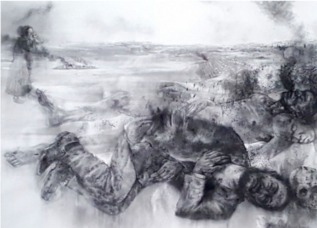
Long sleep of Remorse – charcoal on paper 112 cm x 149 cm