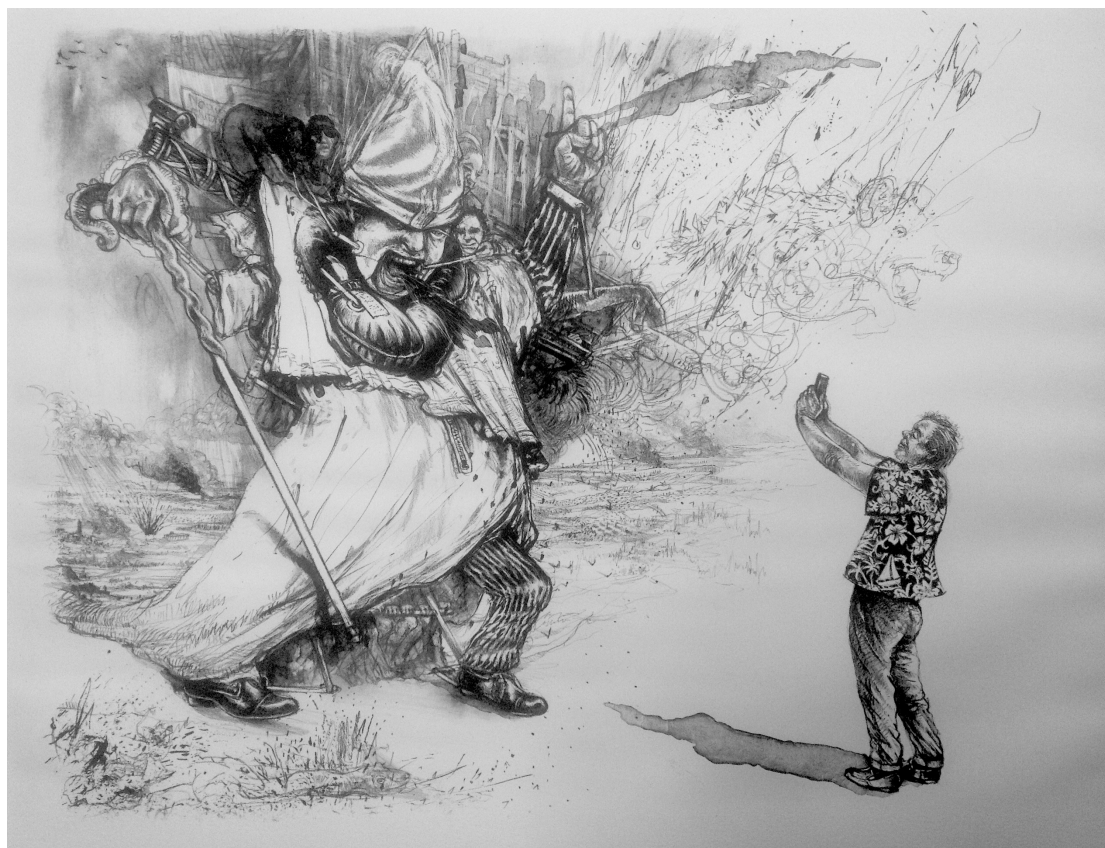
Showing truth to power - lithography on paper, 55 cm x 66 cm

David Krut Projects (DKP) Chelsea, New York, October 2017