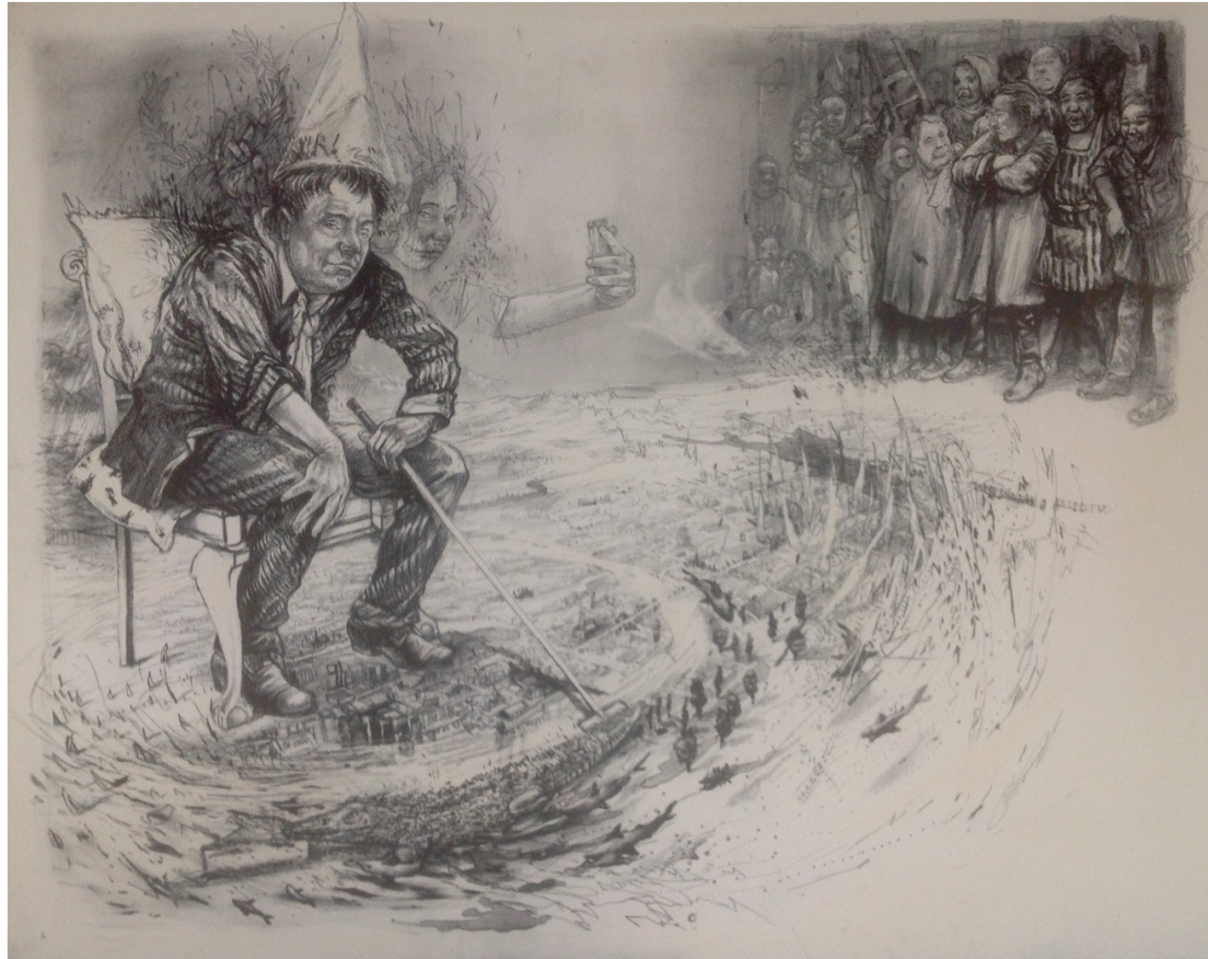
little dystopia – lithograph [ drawing on stone ] 55 cm x 66 cm

The print showing truth to power was used by CCP as their collector's mystery print for 2017.