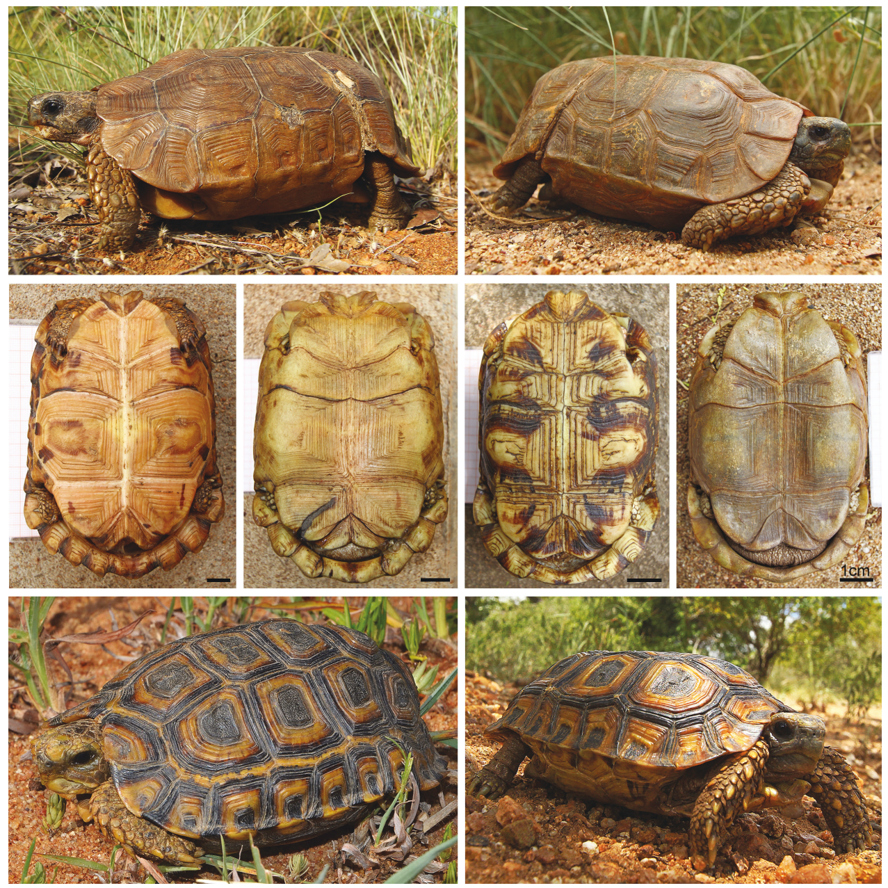
Fig. 2. Top : Lateral views of adult Kinixys lobatsiana (left) and K. spekii (right). Center : Ventral views of young (SCL 106 mm) and adult (SCL 161 mm) K. lobatsiana (left) and young (SCL 131 mm) and adult (SCL 151 mm) K. spekii (right). Note the strongly serrated posterior marginal scutes in K. lobatsiana compared to the smooth carapace rim in K. spekii . Bottom: Lateral views of adult K. natalensis (left) and young K. spekii (right).

natalensis additional voucher photographs showing the tricuspid beak should be taken.