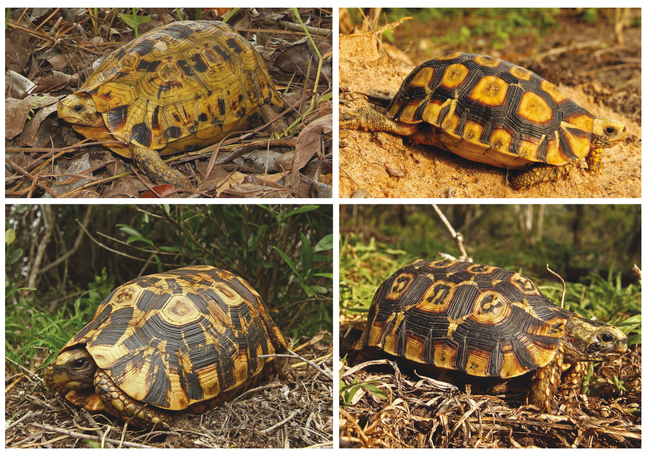
Fig. 3. Top : Lateral views of the putative hybrids from the Afungi Peninsula, Cabo Delgado Province, Mozambique, which have mtDNA sequences of Kinixys spekii but morphologically resemble K. zombensis . Bottom: Lateral views of genetically verified K. zombensis from KwaZulu-Natal Province, South Africa.