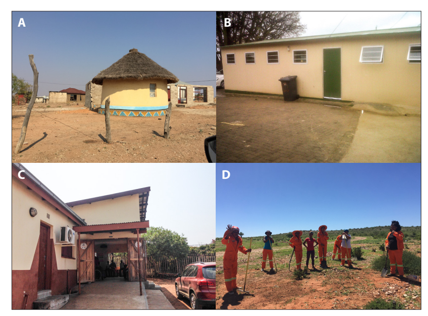
Fig. 1. Settings in which the EHRU has conducted temperature and health-related research projects: (A) dwellings in Limpopo, (B) schools in Johannesburg; (C) clinics in Limpopo; and (D) workers in Northern Cape.

Indoor thermal conditions are an important determinant of cardiovascular and respiratory health problems.<sup>[25]</sup> The EHRU has conducted temperature monitoring studies in key SA settings (Fig. 1) including homes, schools, health facilities and places of work. We found that mean indoor dwelling temperatures were often higher than outdoor temperatures and frequently exceeded international and national recommendations