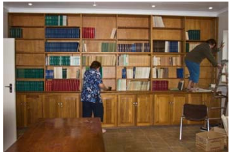
Before and after photos of the library