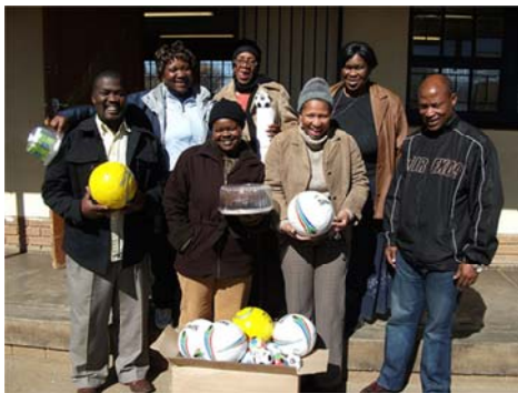
The personnel of the OP Primary School with some of the donated material.

The visit also coincided with Mandela Day on the 18 th of July and it was good to know that we could participate in the endeavour to contribute 67 minutes of our time to creating a better world around us.