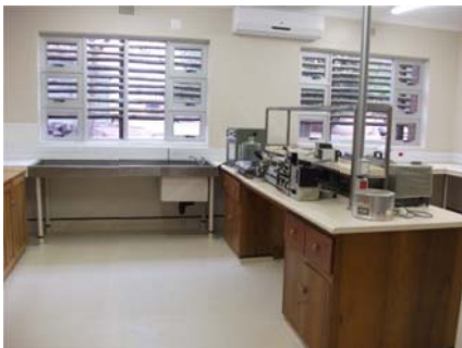
One of the upgraded laboratories