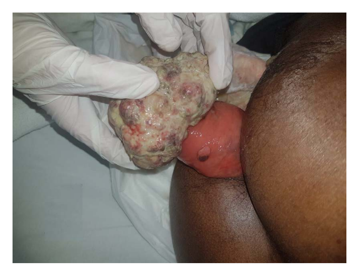
Figure 3. Photograph of the prolapsed rectum and tumour just before surgery.