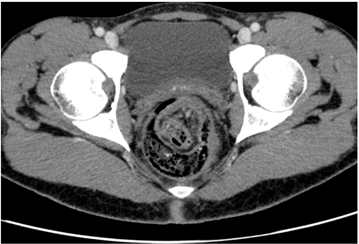
Figure 1 . Transverse slice of a CT scan of the pelvis showing rectoanal prolapse with a tumour at the centre of the rectum.

A diagnosis of an obstructing rectal tumour was made. A transanal biopsy of the tumour was performed which later revealed adenocarcinoma. A diverting sigmoid colostomy was fashioned through a trephine incision in the left lower abdomen. This relieved the symptoms and further workup was commenced. Routine haematological and biochemical tests were normal. A CT scan (figure 1) revealed circumferential thickening of the rectal wall with rectoanal tumour prolapse. No lymph node or liver metastases or ascites were seen. MRI of the pelvis was performed for staging of the tumour (figure 2). This showed a T2 rectal tumour and small lymph nodes in the mesorectum.