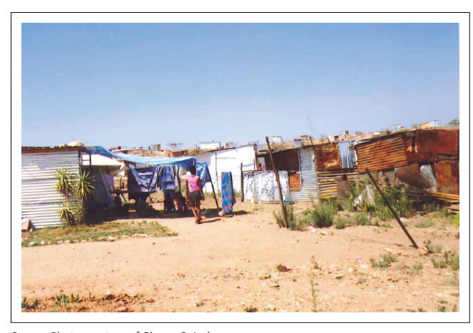
FIGURE 6: Katatura Township, Namibia.

Near East than we westerners can possibly hope to have, knowledge that cannot be found in books. It is my contention that contemporary rural African life may reflect the 1st-century Galilean rural life – one's dependence on the land on a daily basis, the need to trust one's neighbour no matter the time of day or night, the lack of technology and industrialisation, illiteracy that does not exclude