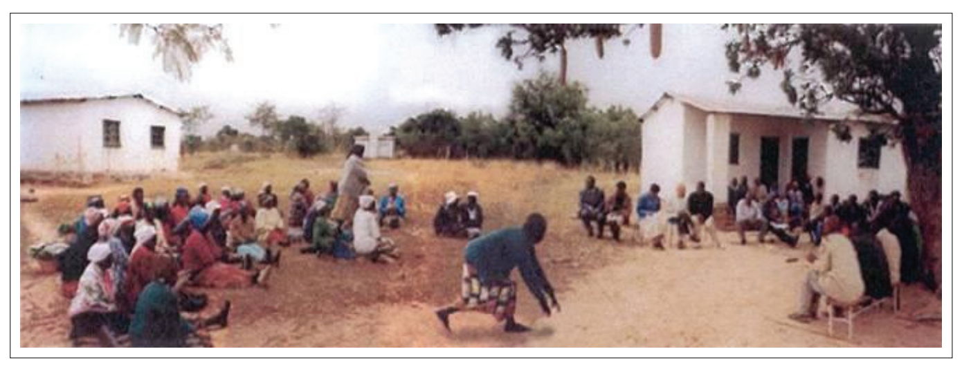
FIGURE 1: Dzobo Village, Zimbabwe.

possibilities, and their understanding of the parables very often becomes that of a new order – when the window gets cracked open, going from the literal to the truly parabolic cannot be stopped – particularly in seeing a new order of justice in whatever world readers of the parables live in – including those in the United States, and especially those who live in unjust and/or poverty-stricken societies. But that new frame of reference comes in many forms, depending on our cultures.