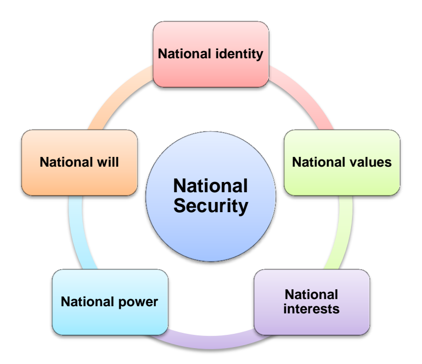
Figure 1: A graphic representation of the national security quintet

including at a regional, continental and systems level also impact on the national security of a state.