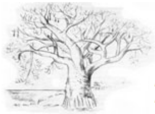
Tree of Knowledge Baobab ('Kremetart') Tree

AIS eProducts Marketing Event AI eProdukte Bemarkingsfunksie