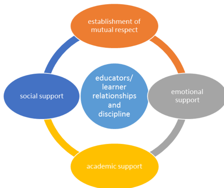
Fig 3.1. Diagrammatic representation of the Conceptual Framework

Louis et al. (2009:118) describe social support as “an exchange of resources between two individuals” (an educator and a learner) in which case “the provider’s aim is to enhance the wellbeing of the recipient.” According to Louis et al. (2009:118) “the effect of support may be positive, negative or neutral because the outcome is tied to the perceived intentions of either participant.” In other words there “are potential costs and benefits associated with the exchange for both participants,” as suggested by Louis et al. (2009:119). Louis et al. (2009:119) are of the opinion that learners “must signal their need for assistance.” Educators’ ability to accurately read the signal from the learner may on the other hand, “be influenced by a number of complex factors which may include social skills, mood, values about giving help and the characteristics of the setting” (Louis et al. , 2009:120). The benefit of providing support is to keep educators and learners in mutually nurturing relationships and that way mutual respect is created. The benefit for educators comes from the fact because of them the life of the learner has been positively influenced for the better. Based on the above description by Louis et al. (2009) the researcher did conceptual analysis of the following concepts: emotional support, social support, academic support and the establishment of mutual respect.