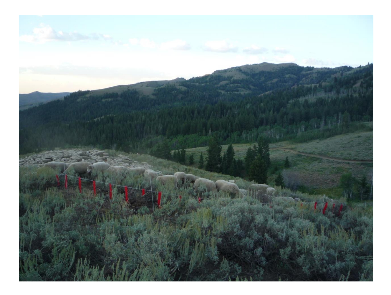
Fig 1. Sheep in a temporary night time corral made of electrified fladry as part of the wood river wolf project in Blaine County, Idaho.