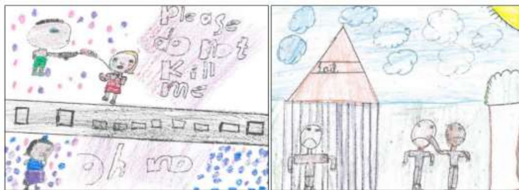
Figure 5: To adhere to the laws of the country means denouncing criminal deeds and sentencing offenders for committed crimes. Sources: (G3/P18/IDW and G3/IDW).

Adhere to the laws of the country (as illustrated below) means having to protect citizens and prosecute acts of wrongdoing.