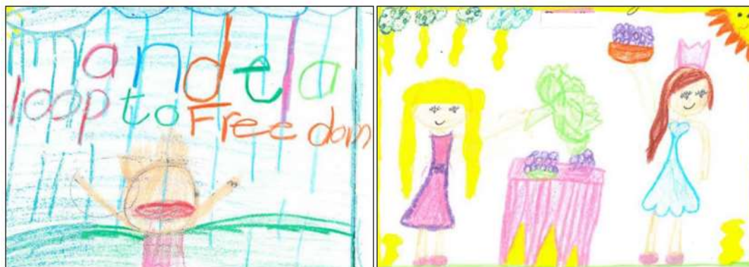
Figure 4: To make the world just and fair means to be free, have good country leaders and create job opportunities. Sources: (G2/P22/IDW and G2/P13/IDW).

By means of illustration (below), the children expressed a belief that the world can be made just and fair if leadership groups symbolize the advantages of freedom for everybody and empower the population through the provision of educational and employment opportunities.