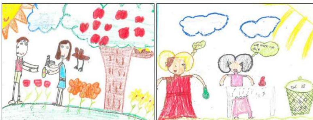
Figure 3: To pursue positive behaviour means taking care of others and not abusing alcohol. Sources: (G2/P8/IDW and G3/P10/IDW).

In pursuing positive behaviour (as illustrated below), a person should avoid abusing any substances since it may result in unhealthy social-emotional events. A person should also share food and resources with others.