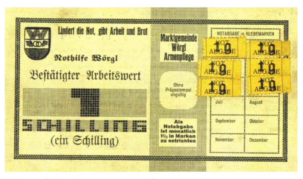
Figure 2.2: A Wörgl Schilling with demurrage stamps affixed