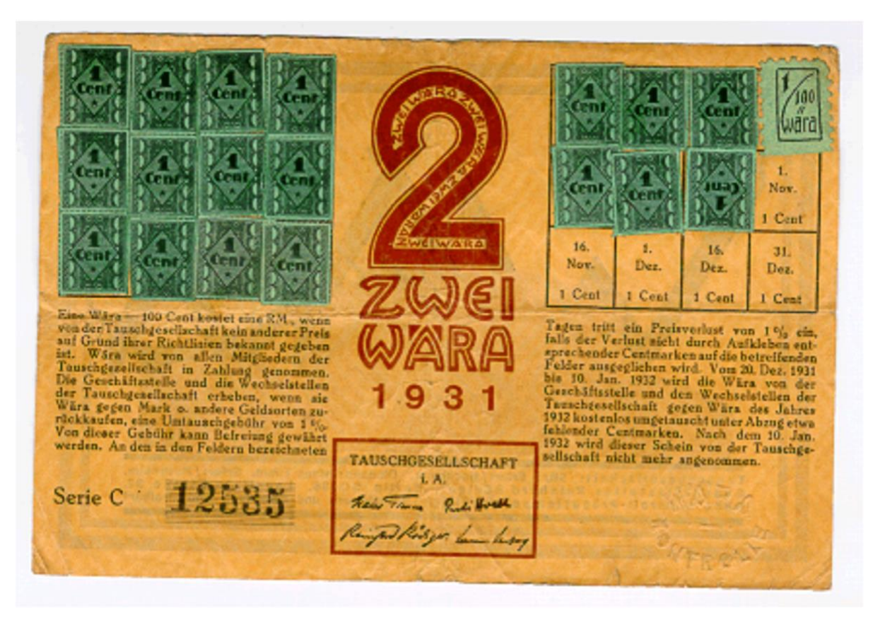
Figure 2.1: WÄRA note affixed with stamps to maintain circulatory validity

circulation of WÄRA, which stimulated a steady sales volume for goods. This currency actually became the centrepiece of a free currency movement, which based its theory on Gesell's works. Despite great initial promise, WÄRA was, along with other alternative currencies, prohibited under German law by the finance minister, H. Dietrich, in October 1931 (Laubisch 2013: 39).