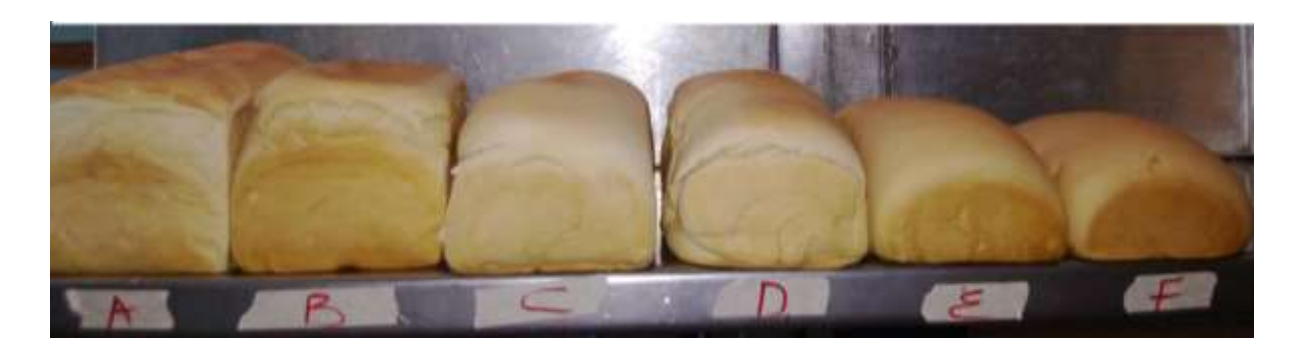
Fig 1. Fresh loaves of composite bread baked with different levels of peanut flour

50% = Composite bread baked with 50 parts peanut:50 parts wheat flour