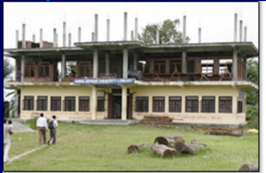
The Jhuwani Community Library

Rural Education and Development (READ) Nepal received the 2006 Access to Learning Award for its innovative approach to building and sustaining village libraries. Free access to books and information technology is advancing learning and literacy in the country's underserved, rural population.