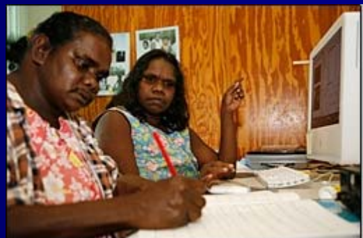
Library staff in Angurugu work on "Our Story."