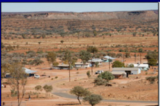
The remote indigenous community of Ltyentye Apurte.