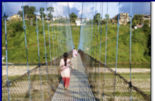
The new bridge now shortens the walk to school