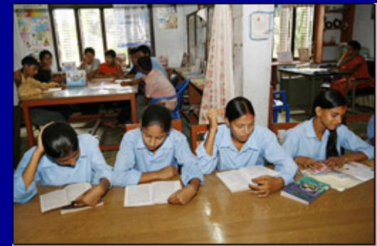
School girls read in the Argyole Community Library

The libraries also serve as social hubs for child care, medical assistance, literacy training, women's discussion groups, AIDS awareness programs, and farming and animal husbandry workshops. These vital social services are provided through READ partnerships with Nepali social welfare providers and university libraries, Nepal National Library, Asia Foundation, and the United Nations Educational, Scientific and Cultural Organization (UNESCO).