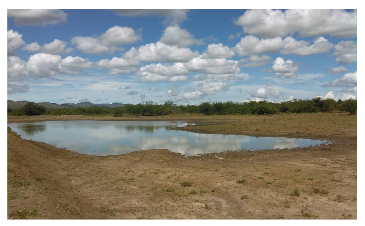
Figure 8: The Mugoto resettlement area dam