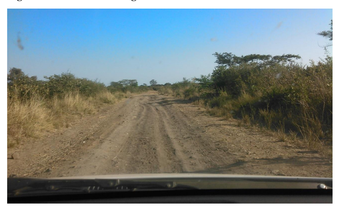
Figure 5: A road in the Mugoto resettlement area