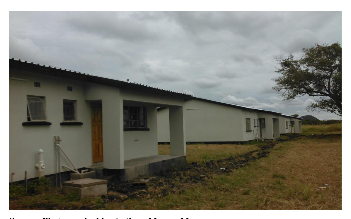
Figure 9: Houses built at Munsangu clinic construction site