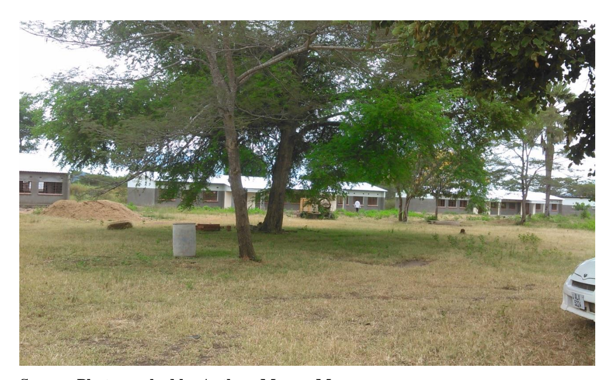
Figure 11: Classroom blocks at Munsangu School construction site