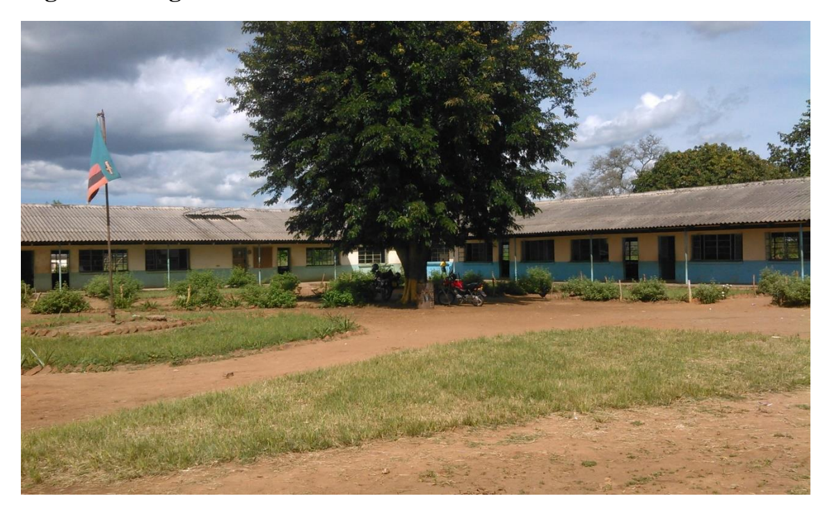
Figure 7: Mugoto Basic School