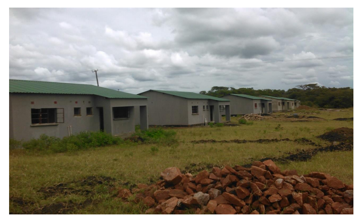
Figure 13: Teachers' houses at Munsangu School construction site