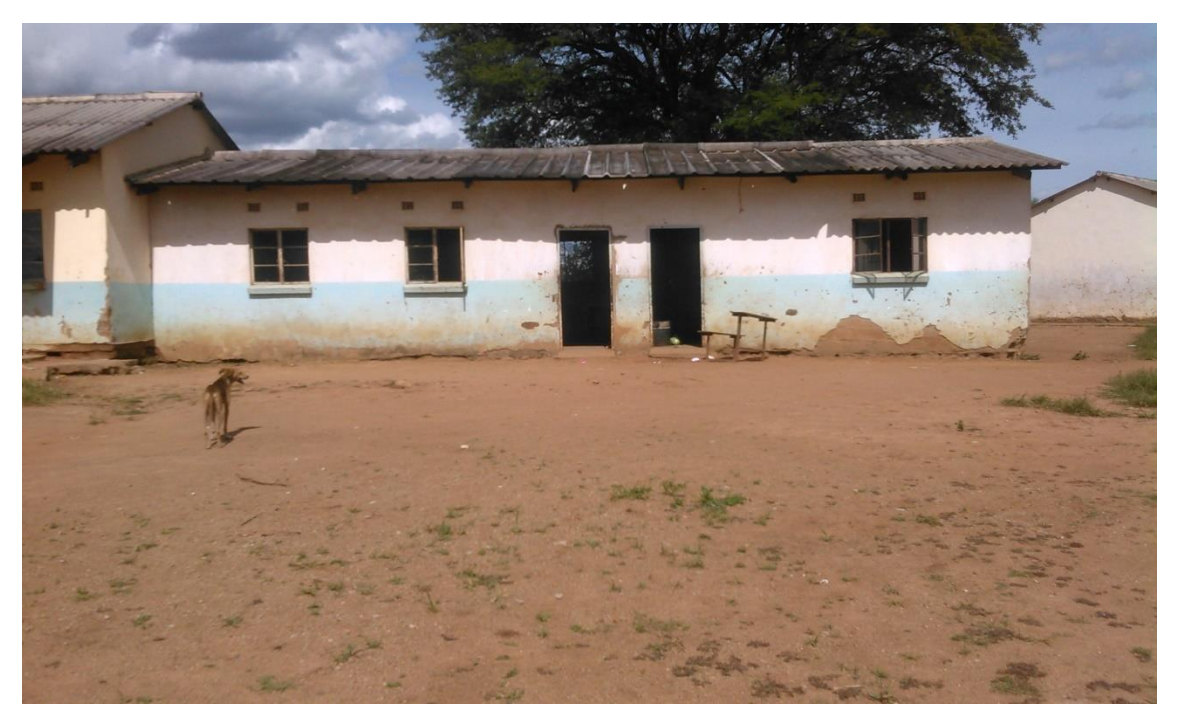
Figure 4: A classroom-block awaiting renovation at Mugoto Basic School