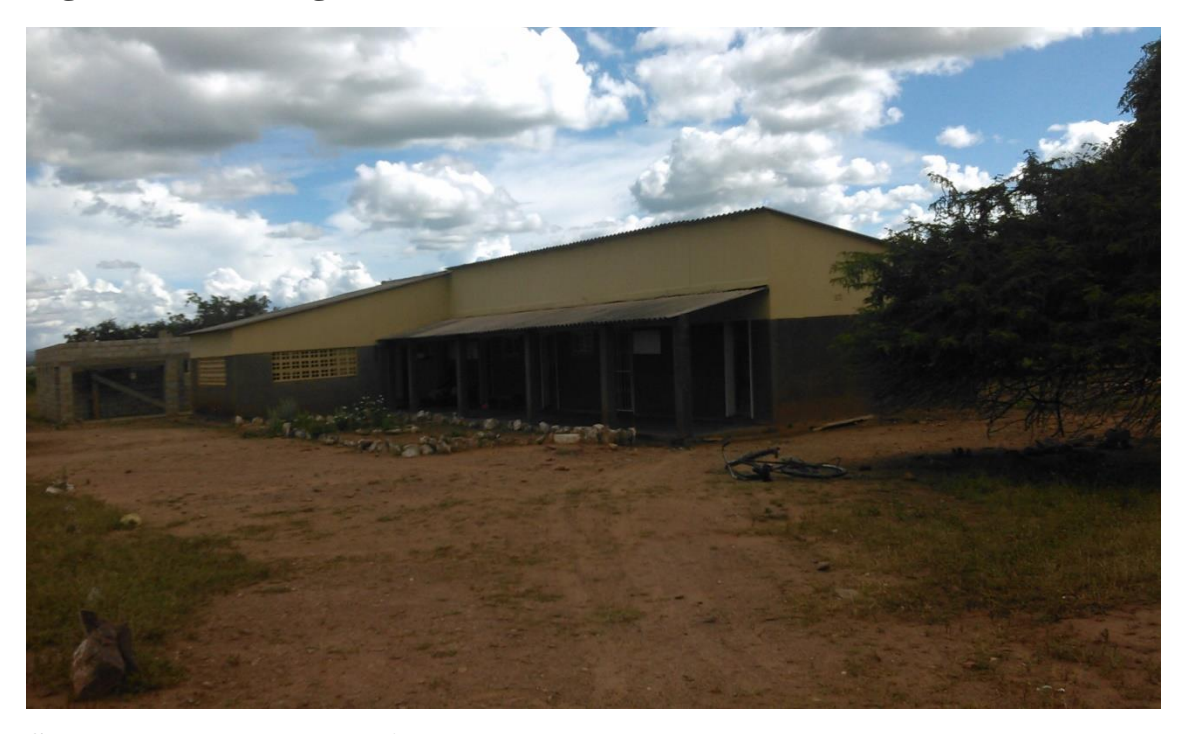
Figure 6: The Mugoto health centre