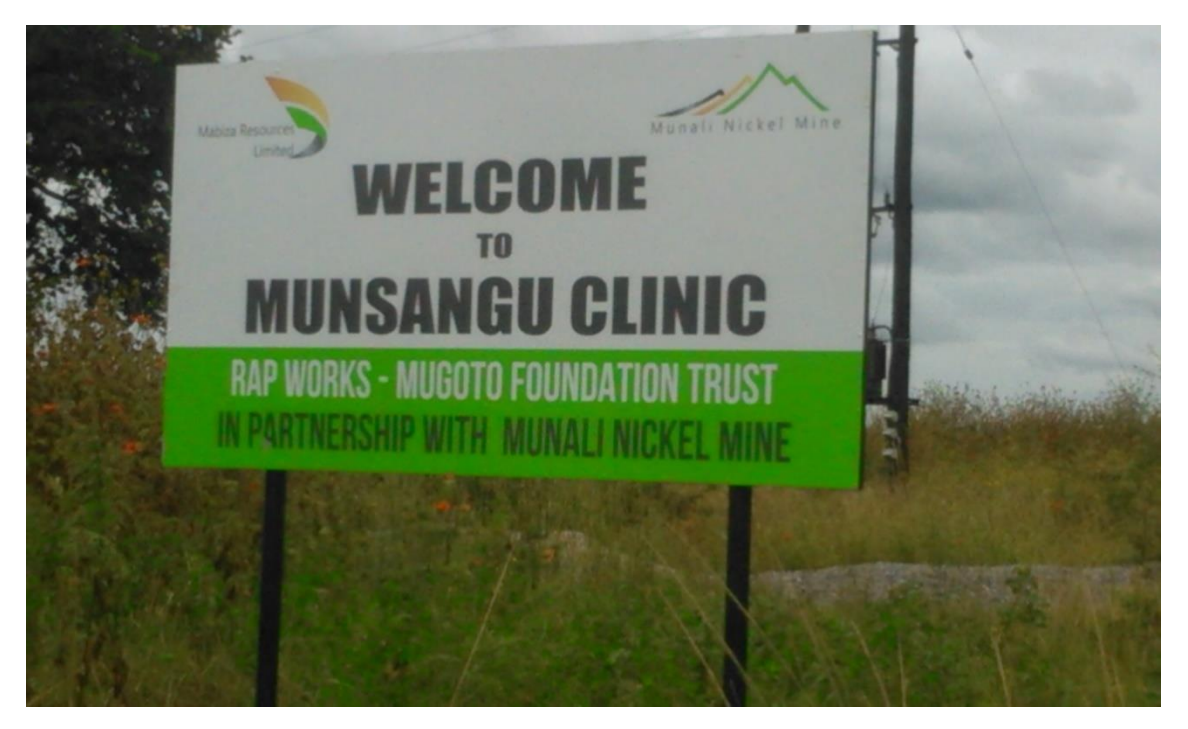
Figure 10: Munsangu clinic construction site