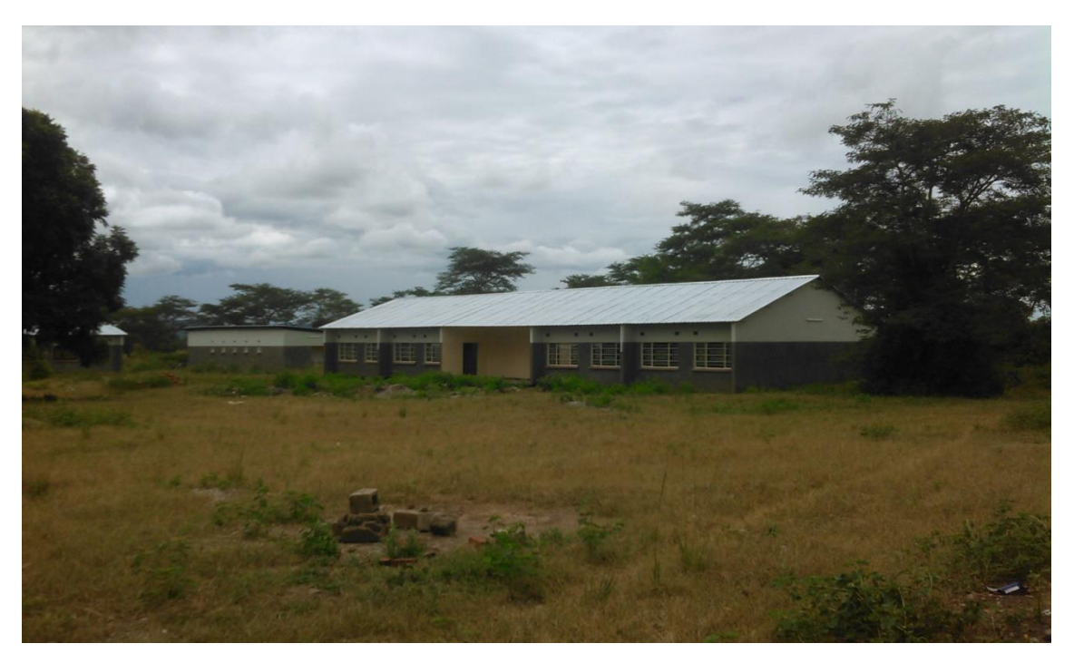
Figure 12: Wood and metal workshops block at Munsangu School building site