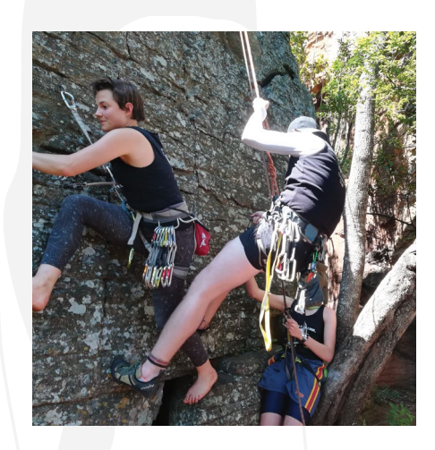
Members of the OPCC will not let an opportunity to climb pass them by.