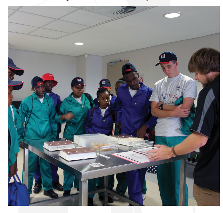
I want to be a vet weekend high-school learners being shown around the skills lab.