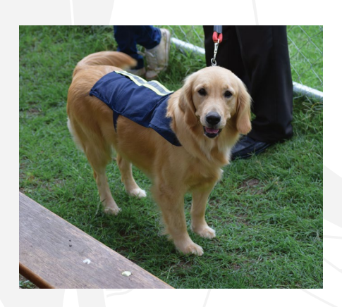
A GDA labrador at the event.