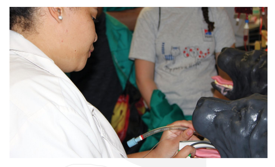
A volunteer demonstrating how to intubate a canine correctly on a skills lab model.