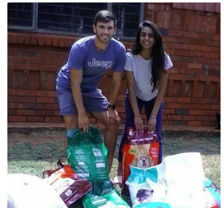
OPVSC members with bags of donated food for Wollies Animal Shelter.

Contact Donavin (072 755 0169) or Nabeelah (071 349 0683) to contribute through the OPVSC.