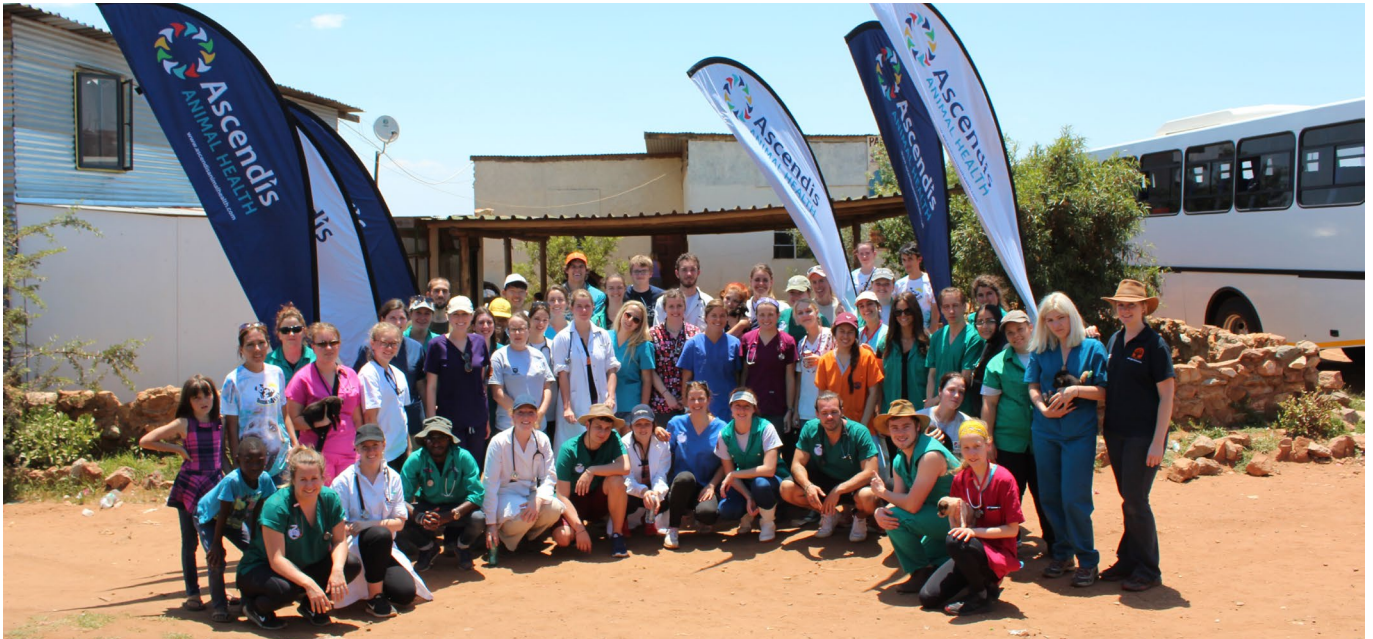
Delegates at one of our community outreach projects that took place during the IVSA symposium.