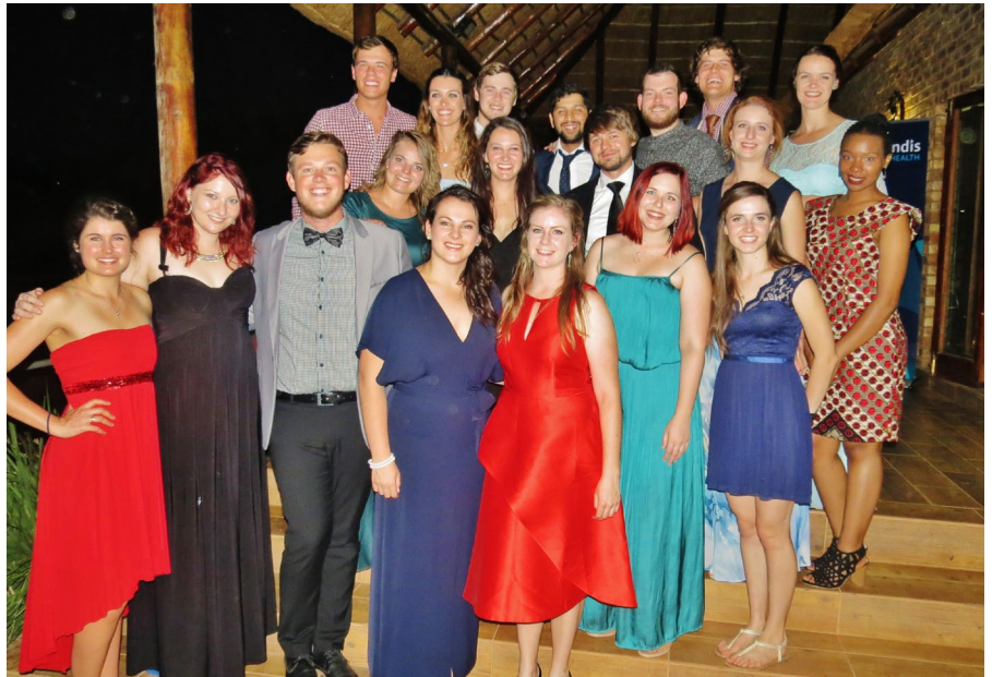
Organising committee of the 66th IVSA symposium.

During this event, I was also elected as the new President of IVSA Global. This is a chance for me to learn from those who know more than what I do, and teach those who do not. It is a once-in-a-lifetime opportunity to be an IVSA ambassador. As an organisation, IVSA has had a tremendous impact on my life, and I am grateful for the chance to play a role in making a difference in other people's lives.