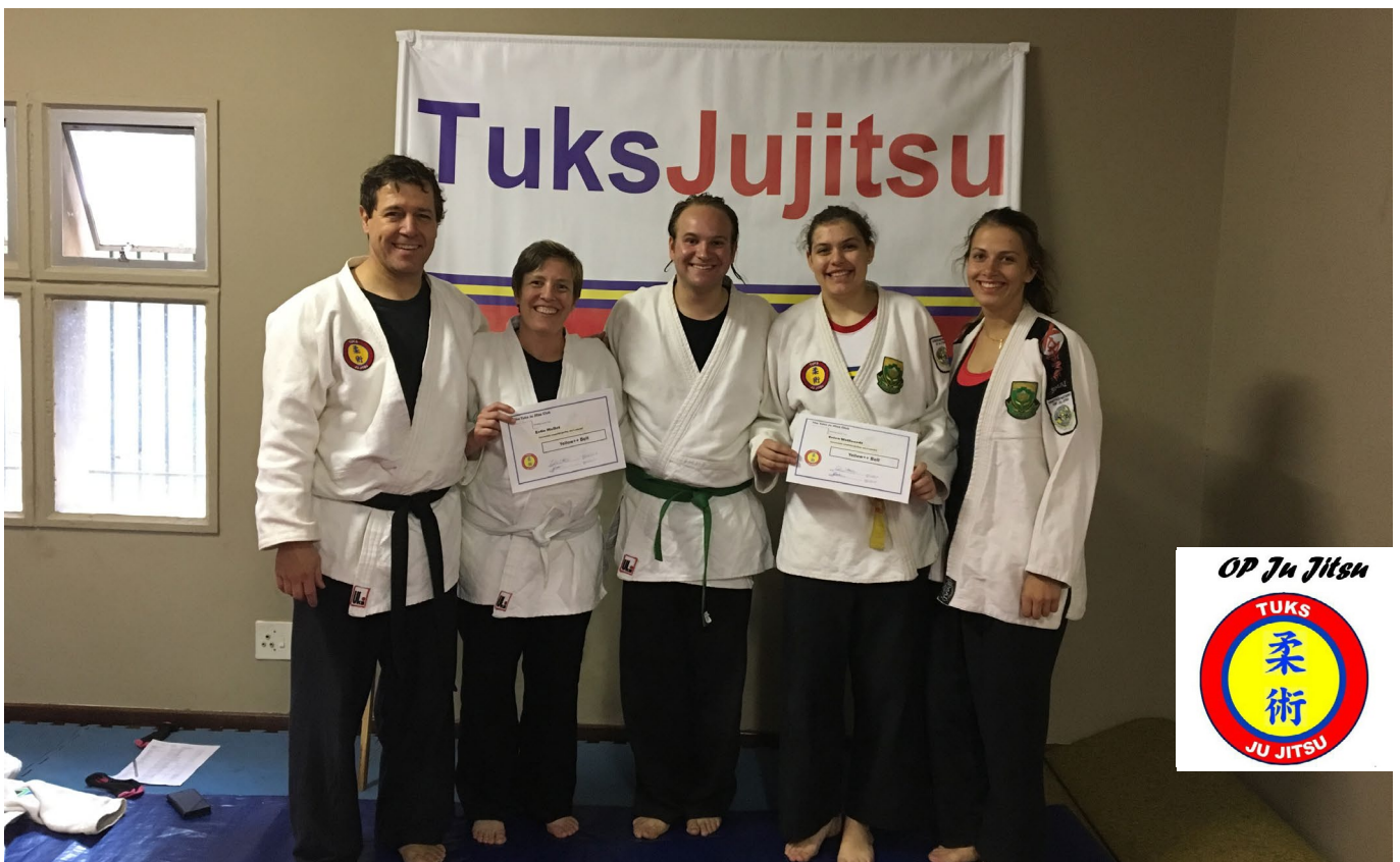
Members of the Onderstepoort Jujitsu club.

Jujitsu involves many different self-defence techniques, including throws, punches, kicks and grappling. We have a Sensei that comes from Hatfield's dojo for the practice sessions on Saturdays and informal training sessions take place on Wednesdays.