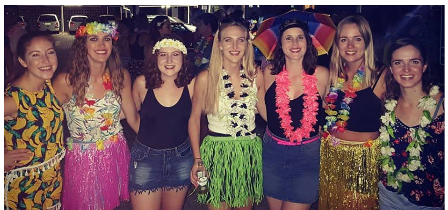
A band of students dressed up for the Hawaiian party.

The Hawaiian party, the first official social of the year, provides our newest recruits with the opportunity to meet and socialise with the seniors. It was also clear to see that the seniors looked forward to the opportunity to meet fresh faces, and practically jumped at the opportunity to