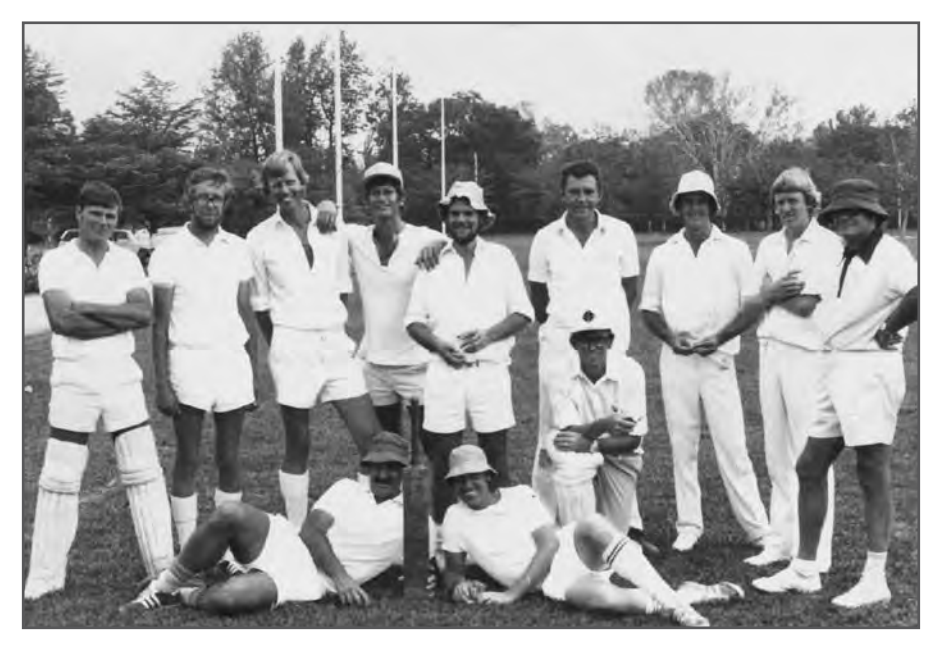
The staff cricket team (Geriatrics II) after a game against the students in 1979.

of frantic activity, when he was appointed Deputy Dean for Undergraduate Academic Affairs and oversaw the building of the Onderstepoort Veterinary Academic Hospital.