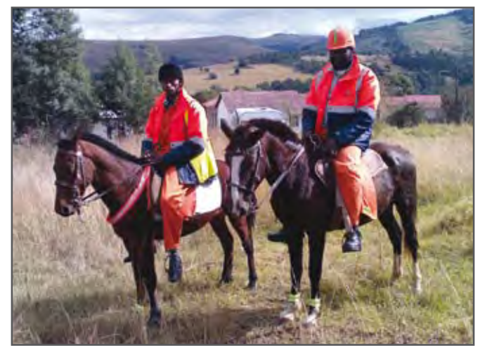
Rangers and their mounts (the 'Transkei 4x4').

One outcome of the course was that the rangers were keen to obtain good tack (as theirs is often old and broken) and it was suggested that the NSPCA could facilitate contact between their association and providers selling suitable saddles and numnahs. The ranger initiative by the Eastern Cape Department of Transport has resulted in salaries for riders and allowances