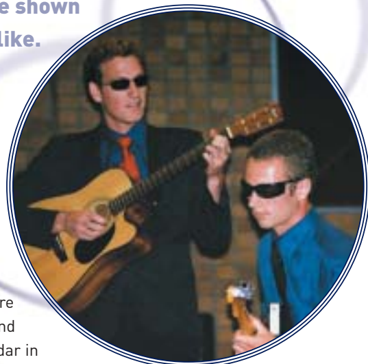
The entertainment at the Dean's Cultural Evening was of an exceptionally high quality.

The evening was unfortunately not well attended, even at the low cost of R25 a ticket. However, I'm sure that this event will be advertised by word of mouth and that it will become a prominent date on the OP calendar in the future.