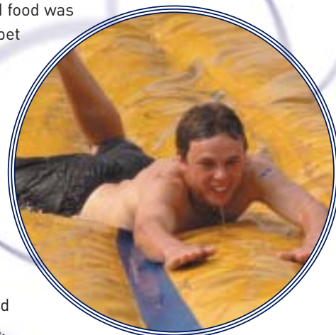
Water slide fun!

Without the support from both the veterinary retail industry and the corporate world, Onderstepoort Rag 2005 would not have been a success. ABSA Bank made a donation towards the fundraising events, which enabled the committee to cover many of their initial costs. Hill's Pet Nutrition also supported the committee financially and donated prizes. Vets Choice/Royal Canin made a considerable contribution towards Rag and Novartis, Woolworths and Bacardi also contributed to making the week a success.