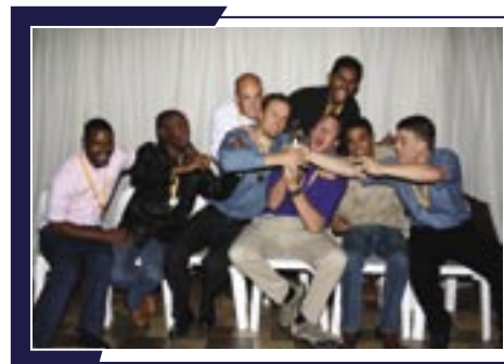
The volleyball trophy.