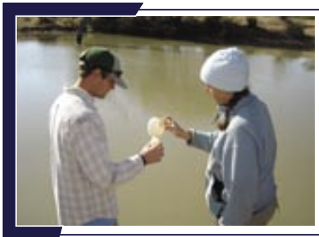
Envirovet students collect a water sample from a waterhole for cyanobacterial research.

During the visit to the Loskop Dam Nature Reserve and Timbavati, students were given the opportunity to participate in some of the research projects of the Department of Paraclinical Sciences. Water samples were collected from waterholes in the Timbavati and several were found to be positive for Microcystis aeruginosa . Reports from Timbavati and the Kruger National Park indicated that large numbers of animals died, during last summer, due to cyanobacteria.