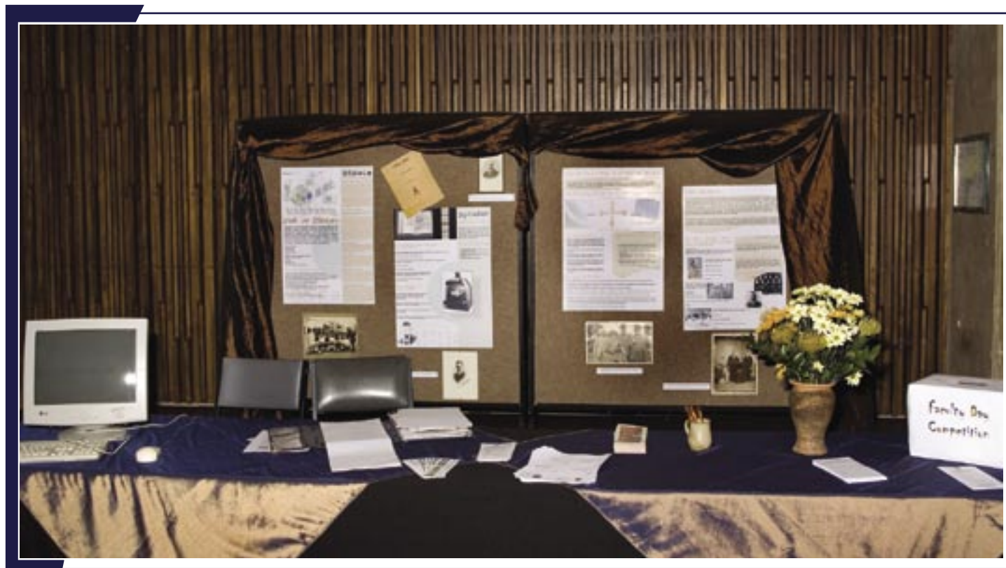
The Theiler Collection makes a valuable contribution to the University's electronic institutional research repository.

Theiler's report on Lamsiekte (Parabotulism) in cattle in South Africa, published in 1927, is currently being studied by a research group in Germany. The library was proud to be in the position to provide the research material as it could not be found in any German library.