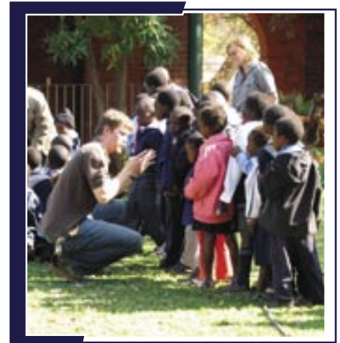
An Envirovet student teaches primary school children from the De Wagendrift combined school about animals, health, the environment and veterinary science.

wildlife species; training and capacity building; epidemiological data collection and management; research and policy development at local, national and international levels.