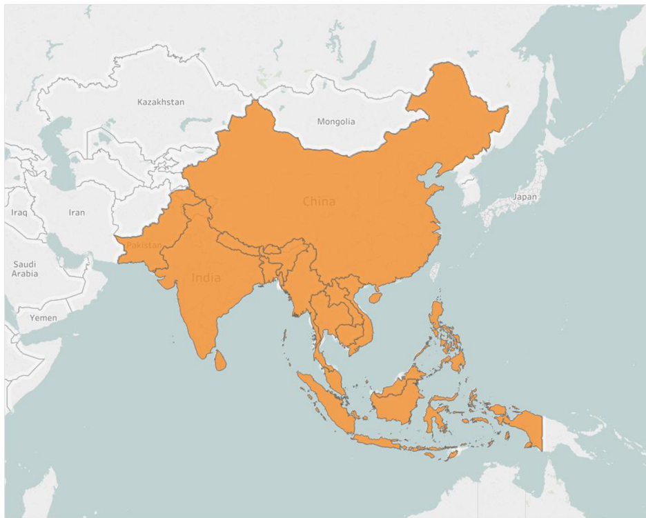
Figure 1. Member countries of ARACON (Asian Rabies Control Network). Two of the member countries invited to participate in the ARACON network (China and Nepal) were unable to attend the inaugural meeting.