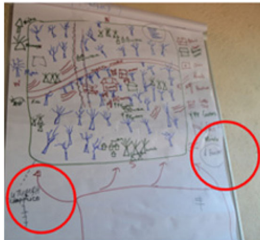
FIGURE 2 Community mapping of digital infrastructure