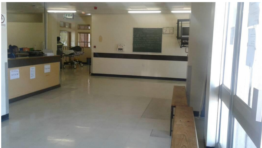
Figure 3.1 Current triage environment

On arrival in the ED environment patients' queue to be triaged by a nurse seated at an open reception desk. Currently the open environment exposes patients to unnecessary invasion of privacy since other patients and relatives make general enquires at the same triage desk. The people making enquiries during triage sessions can overhear other patients' private information thereby invading the patient privacy. The openness of the triage area limits the triage nurse from carrying out activities like initial dressing and the patient information on the triage computer could be viewed by passers-by and patients being triaged as the place is open (view figure 3.1). There is also a hallway demarcated by curtains where patients are kept after triage and privacy and confidentiality becomes compromised making communication between healthcare professionals and patients difficult and intimidating (Lin, Lin, Chen and Lin 2013:1).