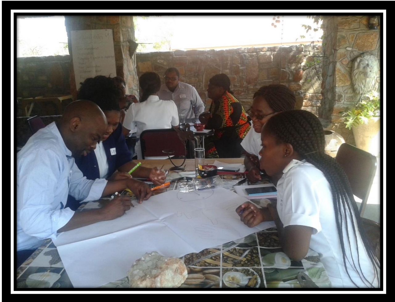
Figure 2.1 Facilitator and HCPs engaged in data analysis

Boomer and McCormack's (2010:644) six-step of creative hermeneutic data analysis method was adapted to analyse the data. Two experienced facilitators, who had previously used the method, organised and led the data analysis. During analysis the researcher asked the participants to avoid influencing interpretation of the findings by bracketing their preconceptions, having empathy for patients' experiences and focusing on the transcribed data (Stenfors-Hayes, Hutt, Dahlgren, 2013:263). The six steps of data analysis as described by Boomer and McCormack (2010:644) were adapted for data analysis.