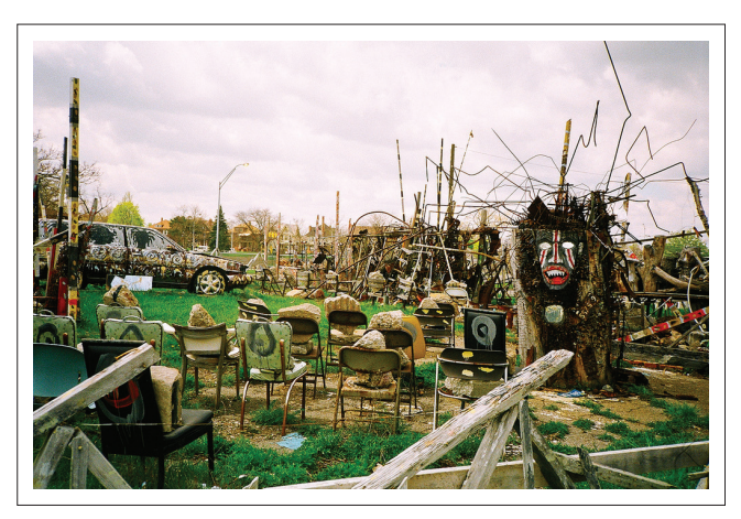
FIGURE 6: Sculpture Garden. 'Iron Teaching Rocks How to Rust'.