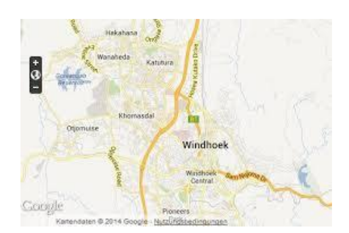
Figure 1: A Map of Khomas region where the study was undertaken

The study was confined to the Khomas Region, Windhoek, in the residential area of Katutura.