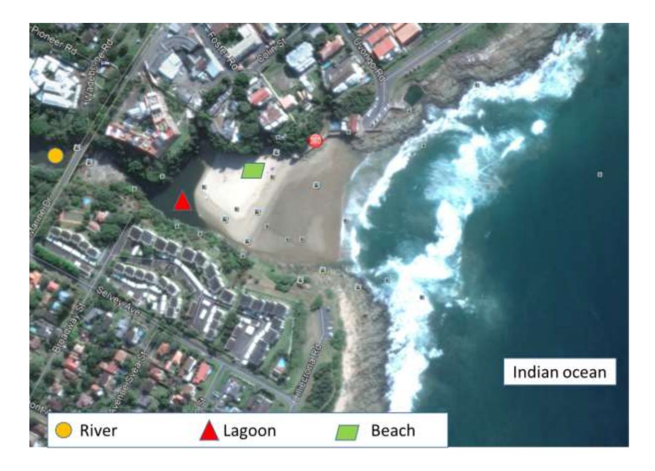
Figure 1: Satellite image of the beach front, showing the lagoon, beach and the river which connects to the lagoon, KZN, South Africa.