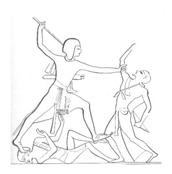
Relief: Abu Simbel (hall of columns of the great rock temple), Ramses II around 1301–1234 B.C.E. (Keel 1978:297)

was a way to be shamed (negative) or dishonoured. In the palette of Narmer the image of the king can be seen showing him trampling on the enemy. The pharaoh is shown as the conqueror and occupier of the foreign land. The trampling of one's enemy comes from the mythological idea of victory over the forces of chaos. The sovereignty of deities was also symbolized by the lower part of the deities' feet (Keel 1978:293, 297).