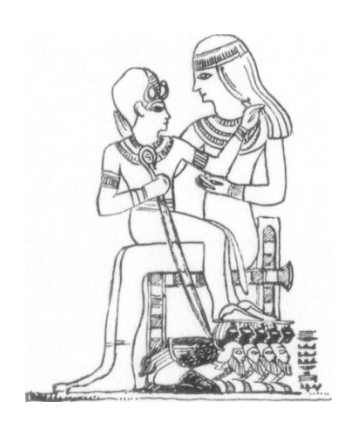
Relief: Amenophis II as the young Pharaoh sitting on the lap of his (wet) nurse. (Rienecker 1967:423; Keel 1978:254)

In most of the depictions it is the pharaoh who is performing the action of trampling on the enemy's head (Keel 1978:297). In the above image an Egyptian warrior is seen performing the action, bringing shame and dishonour onto his enemy by trampling upon his head.