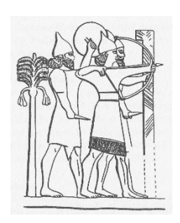
Relief from the palace of Nimrud, from the period of Tiglath-pileser, around the 8<sup>th</sup> century B.C.E.