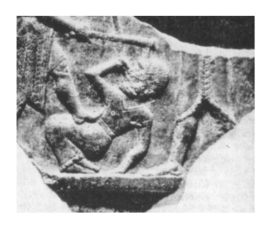
Fragment of a stela from Babylon, 1st Dynasty, around 1800–1500 B.C.E. (Lay 1982: 332)

In the Babylonian context the king or his men in battle would place their feet on the heads or bodies of the enemies. This was a sign of victory and domination. It was part of the depiction of warfare and seen as a way to put fear in the enemy armies (Lay 1982:332). This is illustrated in the image below, where the defeated enemy is being trampled on and the head is being struck by a weapon. As the head represents the body, this is a display of total dominance over the enemy.