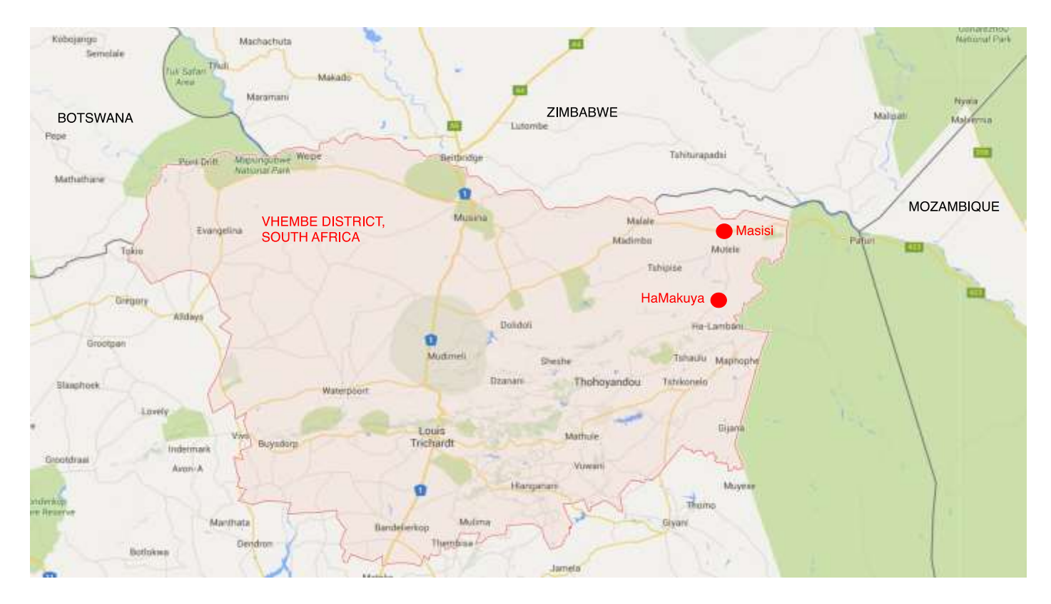
Figure 1b. Vhembe District Map, South Africa