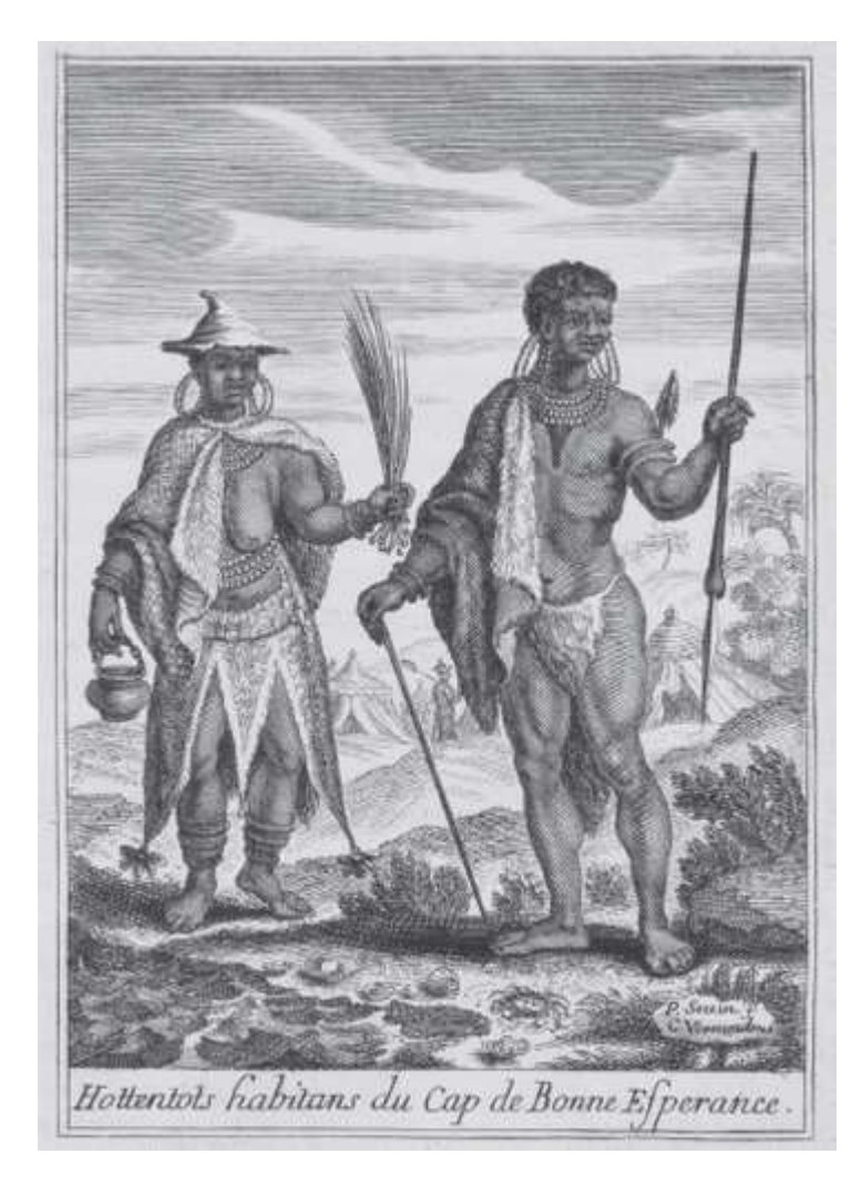
Figure 2. Late seventeenth-century copper engraving of an indigenous couple at the Cape of Good Hope. These people were originally named Hottentotten by the Dutch, after the sounds they uttered while dancing. From: Henri Abraham Chatelain, Coutumes moeurs &c habillemens des peoples qui habitant aux environs du Cap de Bonne Esperance avec une description des animaux et reptiles qui se trouvent dans ce pais (1719), in Henri A. Chatelain., Atlas historique, ou, Nouvelle introduction à l'histoire, à la chronologie & à la géographie ancienne & moderne (Amsterdam 1705-20). This was copied from an earlier engraving that was published in Guy Tachard, Voyage de Siam (Paris, 1686).

The Strandlopers appeared again the following day, bringing with them some rock lobsters or crayfish ( Jasus lalandii ) that were bartered for tobacco and bread (Figure 2). The Europeans, however, were especially looking forward to the promised cattle, as they had not enjoyed fresh provisions for a long time.<sup>40</sup>